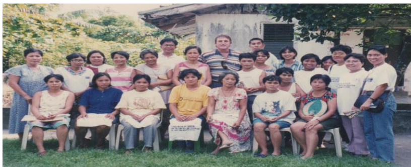
Figure 2 FMD public awareness activities in the Philippines frequently relied on working with women’s community groups.

The general effectiveness of FMD control, both at a national co-ordinating level and at a local field level, dramatically improved with clear indications that efforts at movement control, disease containment and prevention were being undertaken as indicated by the NPCE. In May 2001, the island of Mindanao received the status of FMD freedom without vaccination, followed shortly by the island groups of Visayas, Palawan and Masbate in May 2002. The last reported outbreak of FMD in the Philippines occurred in December 2005 in Lukban, Quezon province in central Luzon, with eventual OIE declaration of freedom with vaccination in 2011 and without vaccination in 2015. The eventual success of the NPCE program was considered to be driven by the incentives of export marketing opportunities for large-scale commercial producers, with the government actively seeking assistance of the private sector to help finance the eradication program (Randolph et al., 2002). 7 The total cost