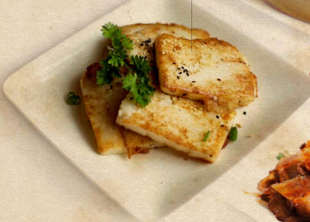
TT07 Pan Fried Daikon Cake