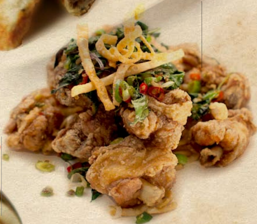
S TT24 Salt & Pepper Fried Chicken