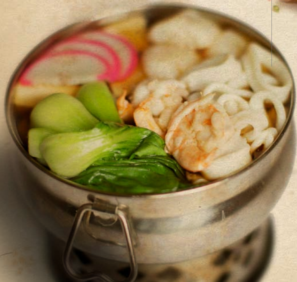
TT11 Seafood Hot Pot