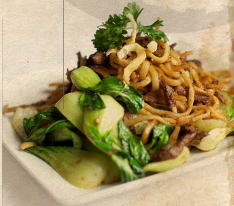
PK05 Shredded Pork with Bamboo Shoot & Dried Tofu