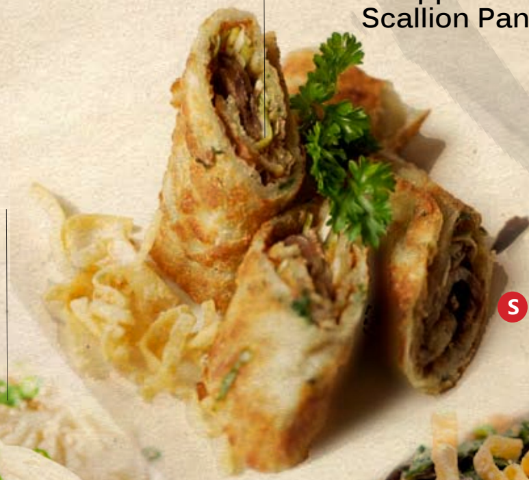
TT25 Sliced Beef Wrapped in Scallion Pancake