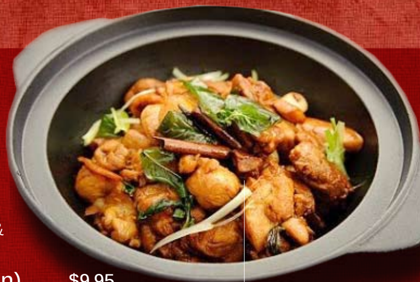
CUP01 Three-Cup Chicken