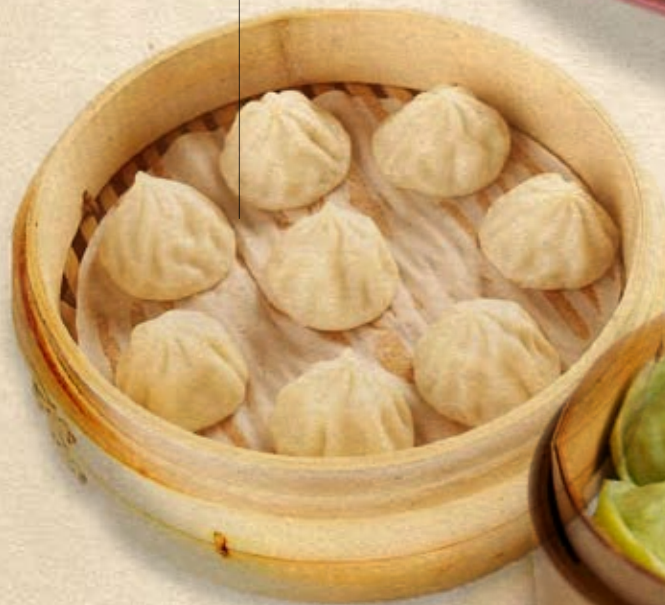
TT29 Steamed Mini Juicy Pork Buns