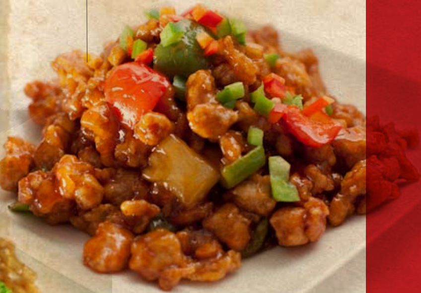
CS05 Mango Chicken