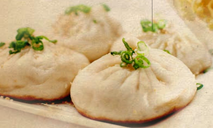
TT33 Pan Fried Pork Buns(4)