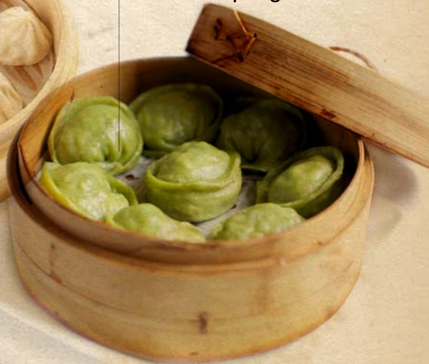
TT16 Steamed Vegetable Dumplings