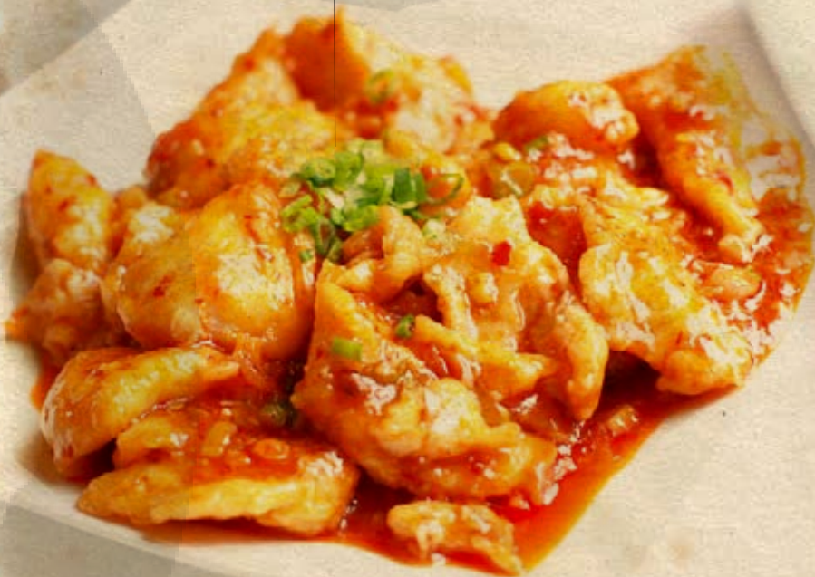
S CS14 Szechuan Flounder Fish Fillet