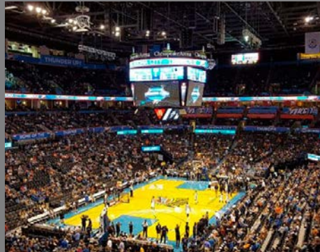
CHESAPEAKE ENERGY ARENA Oklahoma City, OK