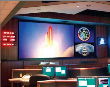
NORTHROP GRUMMAN Azusa, CA