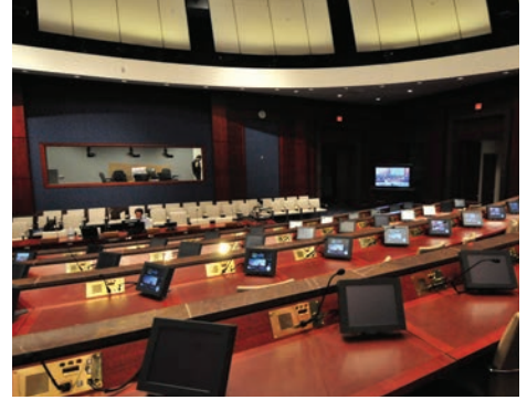
U.S. HOUSE OF REPRESENTATIVES Washington, D.C.

The U.S. House of Representatives engaged Ford AV to install new AV systems for multiple hearing rooms in 2002. Every year since, the U.S. House has awarded Ford AV additional projects and has come to depend upon precision installation that meets their demanding time schedules. Over four decades, Ford AV has provided installations for all levels and branches of governmental entities - Federal, state and local.