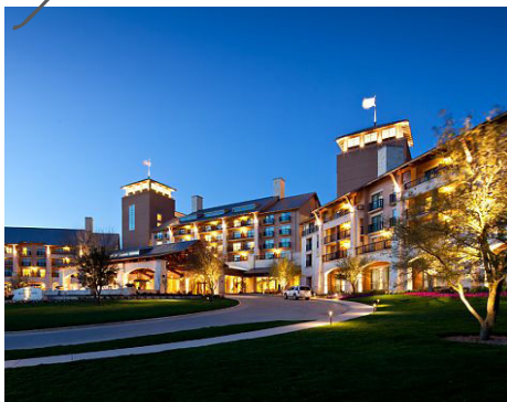
JW MARRIOTT HILL COUNTRY RESORT San Antonio, TX