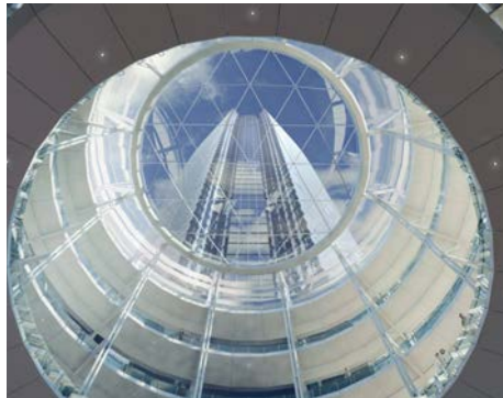
DEVON ENERGY Oklahoma City, OK