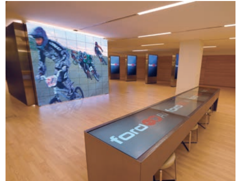
EXECUTIVE BRIEFING CENTER Dallas, TX

In today's market, digital signage is simply a smart business move. With this informational marketing resource, you can present your company's message instantaneously to customers worldwide from a desktop computer. Whether updating prices on a fast food menu or displaying the benefits of the latest hybrid car, let Ford AV provide the system while you decide how to creatively target your customers.