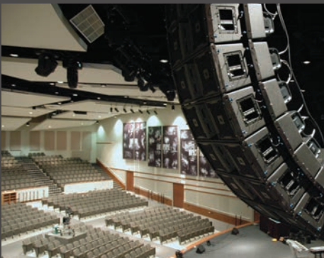
SOUTHEAST CHRISTIAN CHURCH Parker, CO