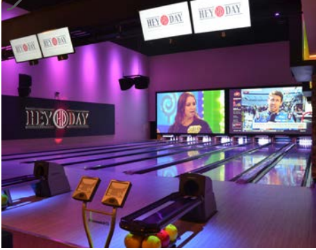
HEYDAY ENTERTAINMENT Moore, OK