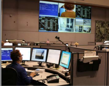
DALLAS/FORT WORTH INTERNATIONAL AIRPORT Dallas/Fort Worth, TX