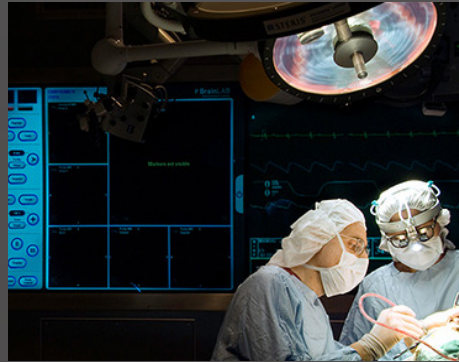
MD ANDERSON CANCER CENTER Houston, TX