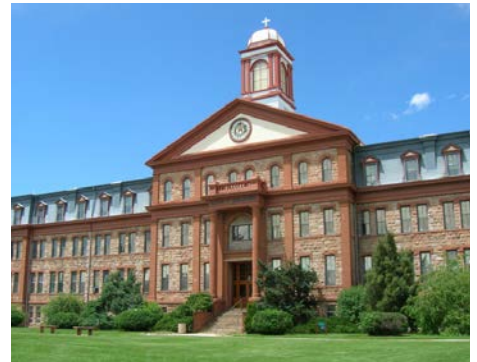
REGIS UNIVERSITY Denver, CO

The classroom is experiencing a global shift in providing curriculum to students through the use of computers, networks and AV display technology. Blackboards are replaced with interactive whiteboards, TVs replaced with digital displays, and distance learning extends the reach of teachers to students all over the world. Educators use AV technology to help shape the minds of students who have grown up using computers and AV systems.