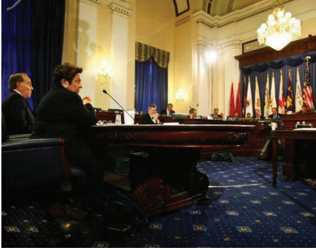
VETERANS AFFAIRS COMMITTEE BOARDROOM Washington, D.C.