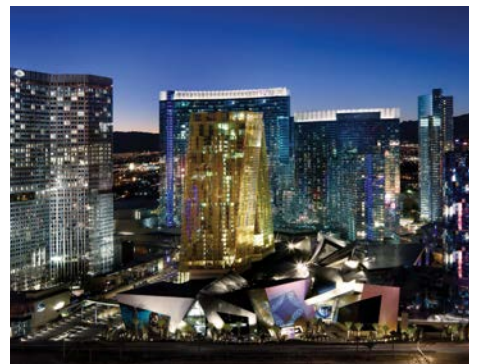
CITY CENTER Las Vegas, NV

On many projects, architects and AV consultants work with Ford AV to design high-quality systems installed to exacting specifications. Some of the consultants we have worked with include: Acentech, Acoustic Dimensions, ADG, Arup, BAi, Coffeen Fricke and Associates, DL Adams, Jaffe Holden, K2 Audio, Kirkegaard, McKay Conant Hoover, PMK, The Sextant Group, Shen Milsom & Wilke, Thorburn Associates, URS, Veneklasen, Akustiks, Cosentini, Datacom Design Group, Dickensheets, HFP, Ross & Baruzzini, TechKnowledge, Waveguide, and WJHW.