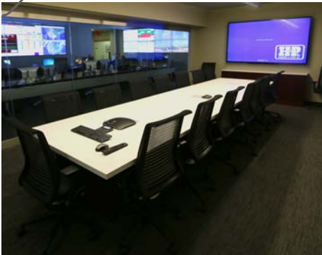
HELMERICH & PAYNE Tulsa, OK