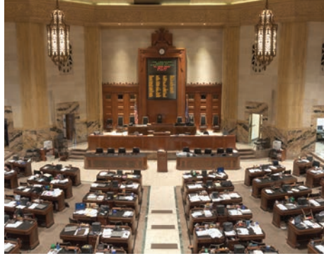
LOUISIANA STATE CAPITOL Baton Rouge, LA