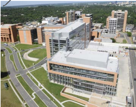
UNIVERSITY OF ARKANSAS FOR MEDICAL SCIENCES Little Rock, AR