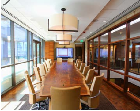
IMA Denver, CO