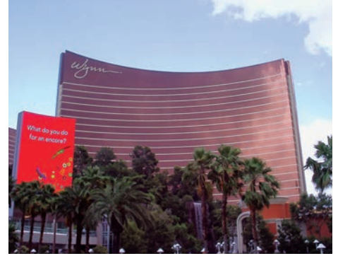
WYNN CASINO Las Vegas, NV

Conference centers and meeting facilities are expected to provide a unique setup for their customers' needs. This requires a flexible infrastructure system and an AV system that is equally flexible. Using wireless touchpanels, AV media, computer graphics, and data from any source can be routed to any combination of rooms in the facility. There are more ways than ever to enhance a visitor's experience.