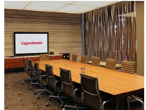
EXXONMOBIL Houston, TX

Energy companies use advanced AV systems with 3D visualization to find new sources of oil and gas. Videoconferencing systems improve communications resulting in better business decisions and the distribution of information and energy products. The use of AV technology can provide faster decisions with the ability to quickly and easily collaborate anywhere and anytime.