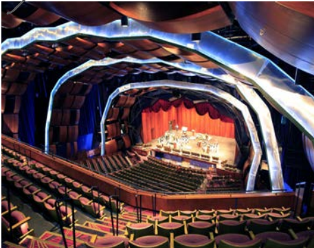
MCALLEN PERFORMING ARTS CENTER McAllen, TX