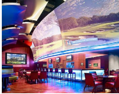
JW MARRIOTT HILL COUNTRY RESORT San Antonio, TX