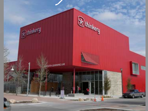
AUSTIN CHILDREN'S MUSEUM - THINKERY Austin, TX

"Our visitors are literally from around the world and Ford AV helps us deliver our story to the visitors to enhance their visit here and bring attention to memorial mission."