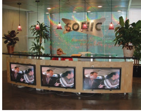
SONIC INDUSTRIES Oklahoma City, OK