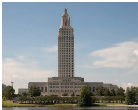
LOUISIANA STATE CAPITOL Baton Rouge, LA