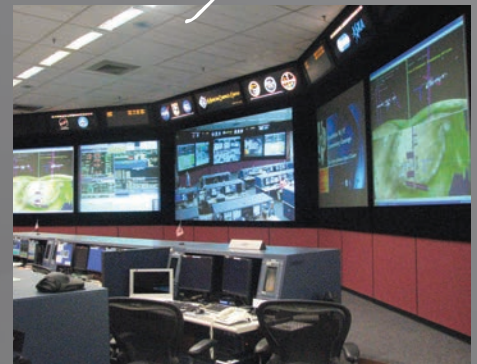
JOHNSON SPACE CENTER MISSION CONTROL Houston, TX

"I am very happy to recommend your company in pursuit of additional projects of a very complex nature.."