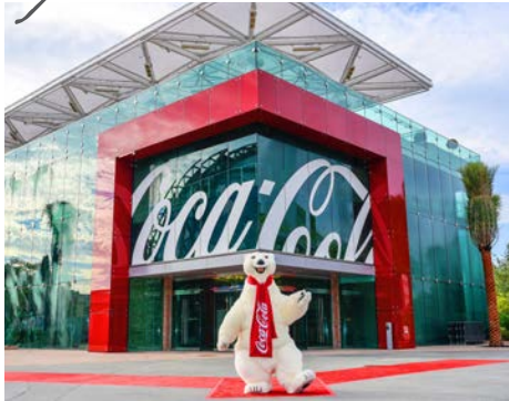
COCA-COLA DISNEY SPRINGS Orlando, FL