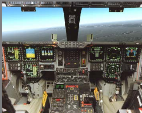
B-2 BOMBER SIMULATOR Tinker AFB, OK