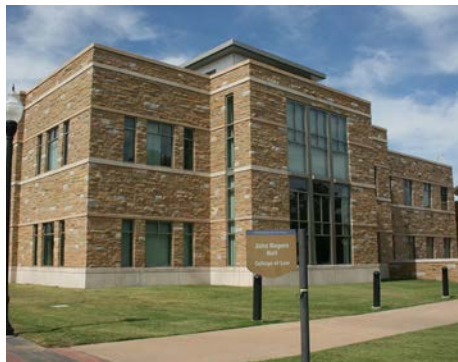
UNIVERSITY OF TULSA LAW SCHOOL Tulsa, OK