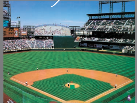
COORS FIELD Denver, CO

"Ford AV's commitment to getting the job done... was very impressive."