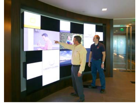
LIBERTY GLOBAL Denver, CO

Business is an exchange of ideas, thoughts, words, promises...In essence, communication is the key to every company's future. Once thought of as a luxury, AV technology has become a necessary means of communication. Whether it's a single boardroom or an entire corporate campus, Ford AV's experienced technical staff will design and install a system to help accomplish your goals.