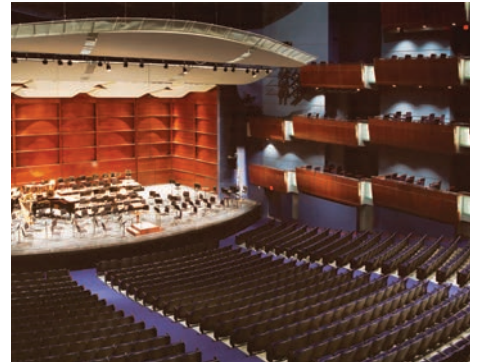
OKLAHOMA CITY CIVIC CENTER Oklahoma City, OK

The house lights dim, a hush settles over the crowd, the curtain opens. Lights! Sound! Action! The audience has come to be entertained and there is nothing like a live performance to provide that thrill, provided the acoustics, audio and lighting technology properly enhance the performers and scenery. To turn a good performance into a great performance, Ford AV provides exactly that balance.