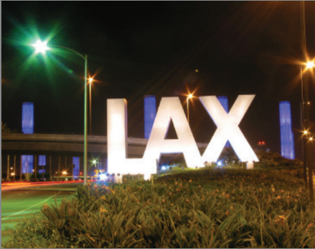
LOS ANGELES INTERNATIONAL AIRPORT Los Angeles, CA