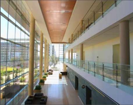
PARKLAND HOSPITAL Dallas, TX