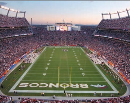
MILE HIGH STADIUM Denver, CO