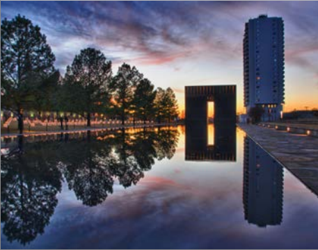
OKLAHOMA CITY NATIONAL MEMORIAL & MUSEUM Oklahoma City, OK