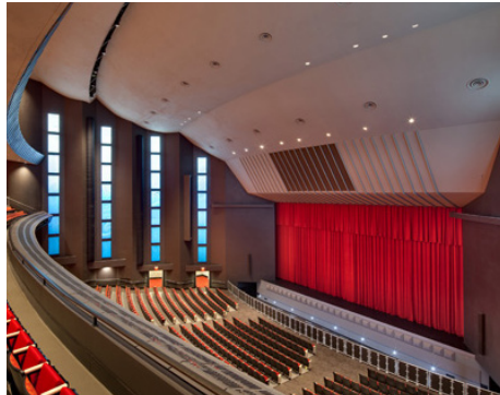
LILA COCKRELL THEATRE San Antonio, TX