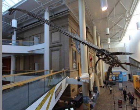
DENVER MUSEUM OF NATURE & SCIENCE Denver, CO