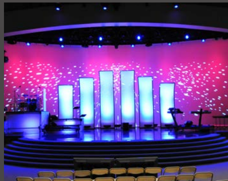
COTTONWOOD CHRISTIAN CENTER Los Alamitos, CA