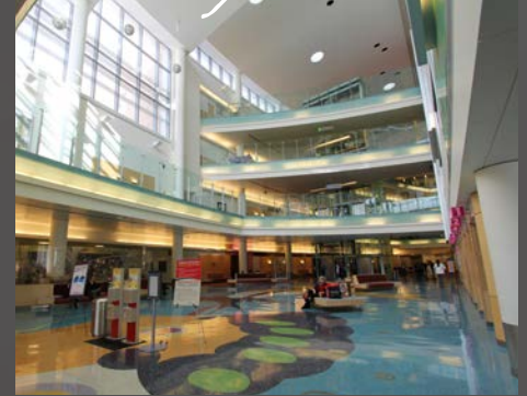
DENVER CHILDREN'S HOSPITAL Denver, CO

"The Ford AV team went out of their way to be flexible. Great work!"