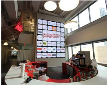
RETAILMENOT Austin, TX