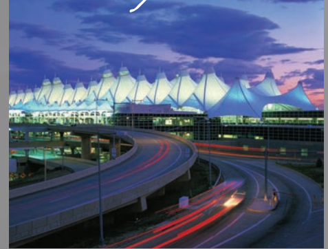
DENVER INTERNATIONAL AIRPORT Denver, CO

"Your team was excellent in every aspect of the project."