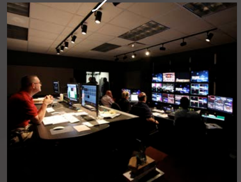
SAGEMONT BAPTIST CHURCH Houston, TX