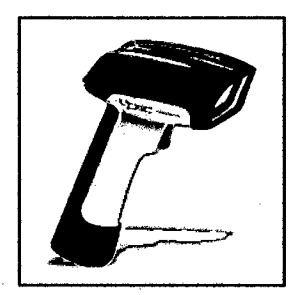
Figure 2.4: Example of Active Non-Contact Scanner

Figure 2.4 shows example of Active Non-Contact Scanner. This type is generally uses a beam of focused light to read the bar code. The most common form of active non-contact scanner uses a laser beam that is automatically scanned back and forth across the symbol at a high rate. Active non-contact scanners may be stationary as are found in grocery stores or they may be hand held. Industrial versions of active non-