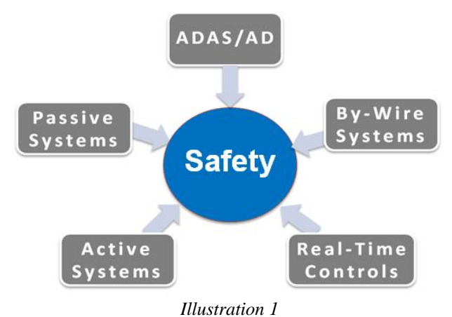
In comparison, the first aircraft autopilot was developed by the [1] Sperry Cooperation in 1912. These systems at their introduction as well as

These hubs support numerous communication protocols such as CAN (Controller Network), LIN (Local Interconnect Network), Automotive Ethernet, FlexRray, MOST (Media Transport), Oriented Systems SPI (Serial Peripheral Interface), SCI (Serial Communication Interface). UART (Universal Asynchronous Receiver/Transmitted), and USB. It also includes various wireless protocols such as LTE (Long Term Evolution) and DSRC (Dedicated Short Range Communication) Wi-Fi (Wireless Fidelity), NFC (Near Field Communication, GSM (Global System for Mobile), CDMA (Code Division Multiple Access), Bluetooth as well as other RF (Radio Frequency) type communication over an almost infinite range of frequencies in support of Cloud Connectivity based applications as well as FOTA (Flash Over The Air) all while supporting Cyber Security through various means such as encryption. In addition to the technologies/techniques of AD operation and the communication protocols supporting operations, FEV Smart Vehicle also supports AI Intelligence) (Artificial and VI (Virtual Intelligence) strategies, while maintaining compliance to various safety standards (e.g. ISO26262; 2011, Mil Std. 882 (E), IEC 61508, edition 2; 2010)\