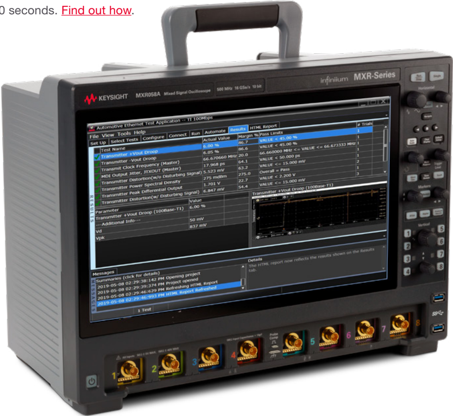
Infiniium MXR-Series Oscilloscope

Set up your Keysight Infiniium oscilloscope to show automotive Ethernet protocol decode in less than 30 seconds. Find out how.