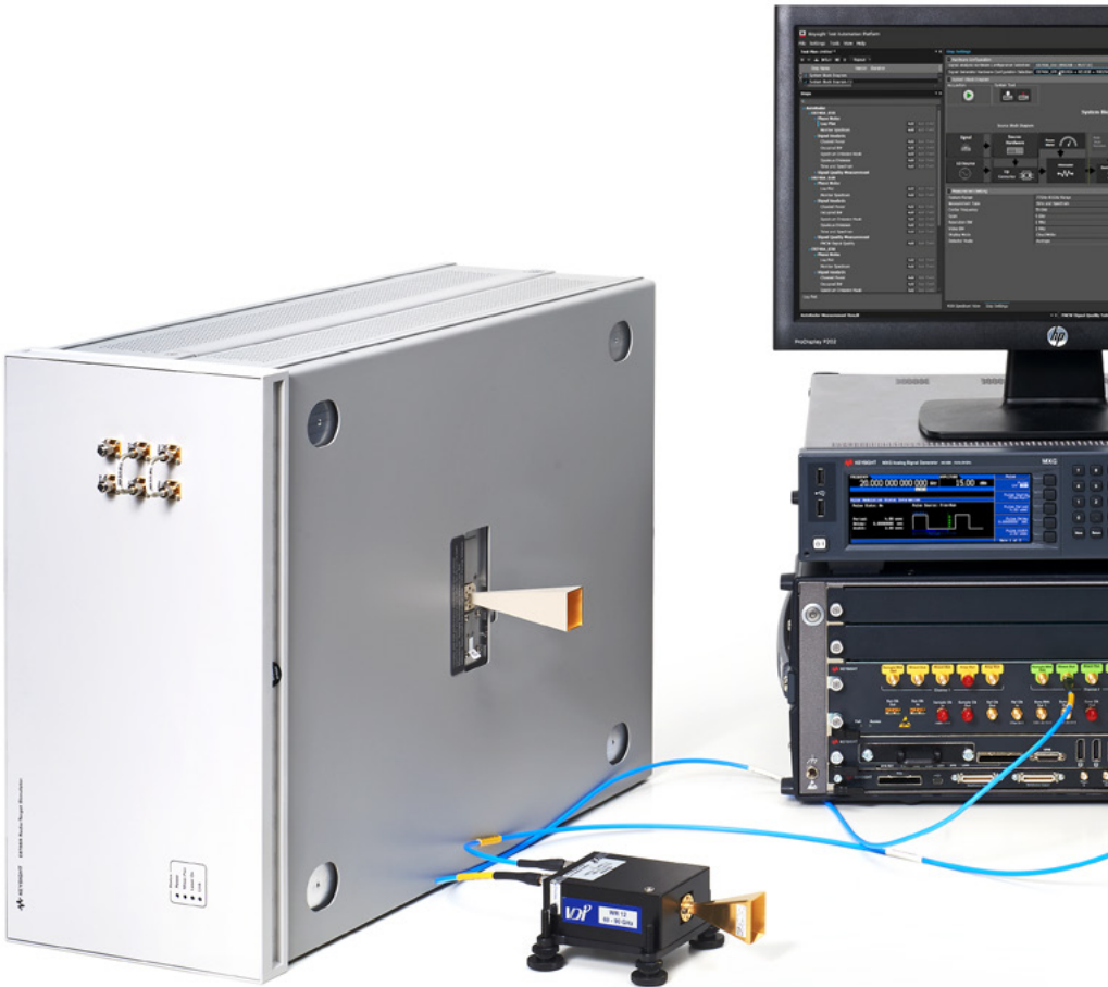
E8740A-080 Interference and Receiver Test Solution