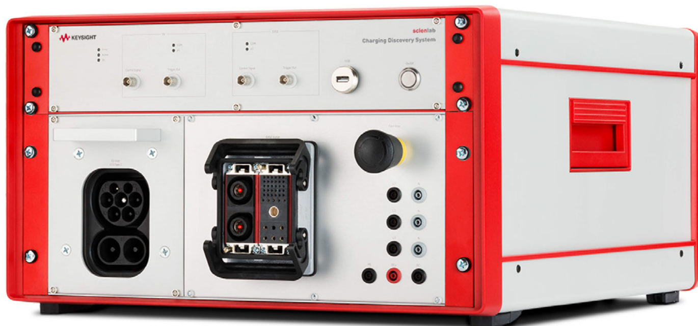
SL1040A Scienlab Charging Discovery System Series