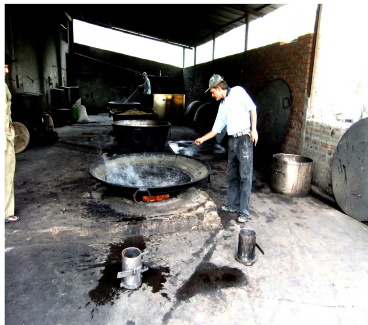
Fig.5. Initial preparation to extract liver tonic from Aloe Vera. IMPCL