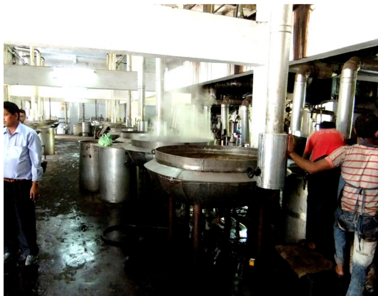
Fig. 6. Machinery used to prepare liver tonic, IMPCL