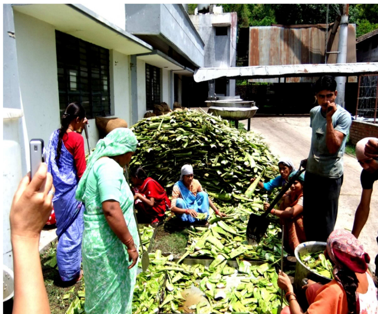
Fig.4. Aloe barbadensis processing to extract liver tonic, Indian Medicines Pharmaceutical Corporation Ltd. (IMPCL), Almora, Uttarakhand.