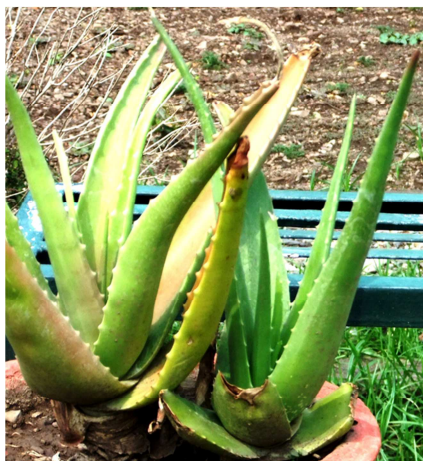
Fig. 1 Aloe barbadensis