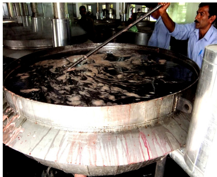
Fig. 7. Extracted Liver tonic from Aloe Vera, IMPCL