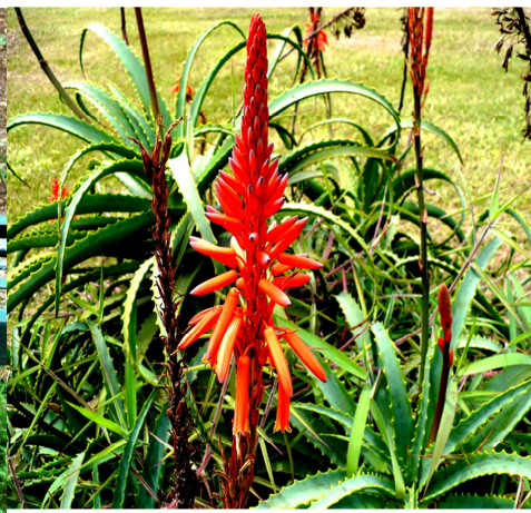
Fig. 2 Aloe arborescens