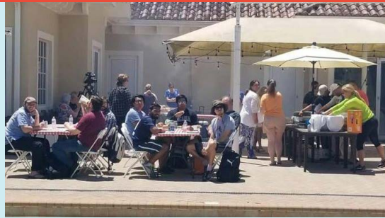
Ave Law Community enjoying an afternoon BBQ

Students, faculty, and staff came together to celebrate another successful school year at our annual end of the year BBQ.