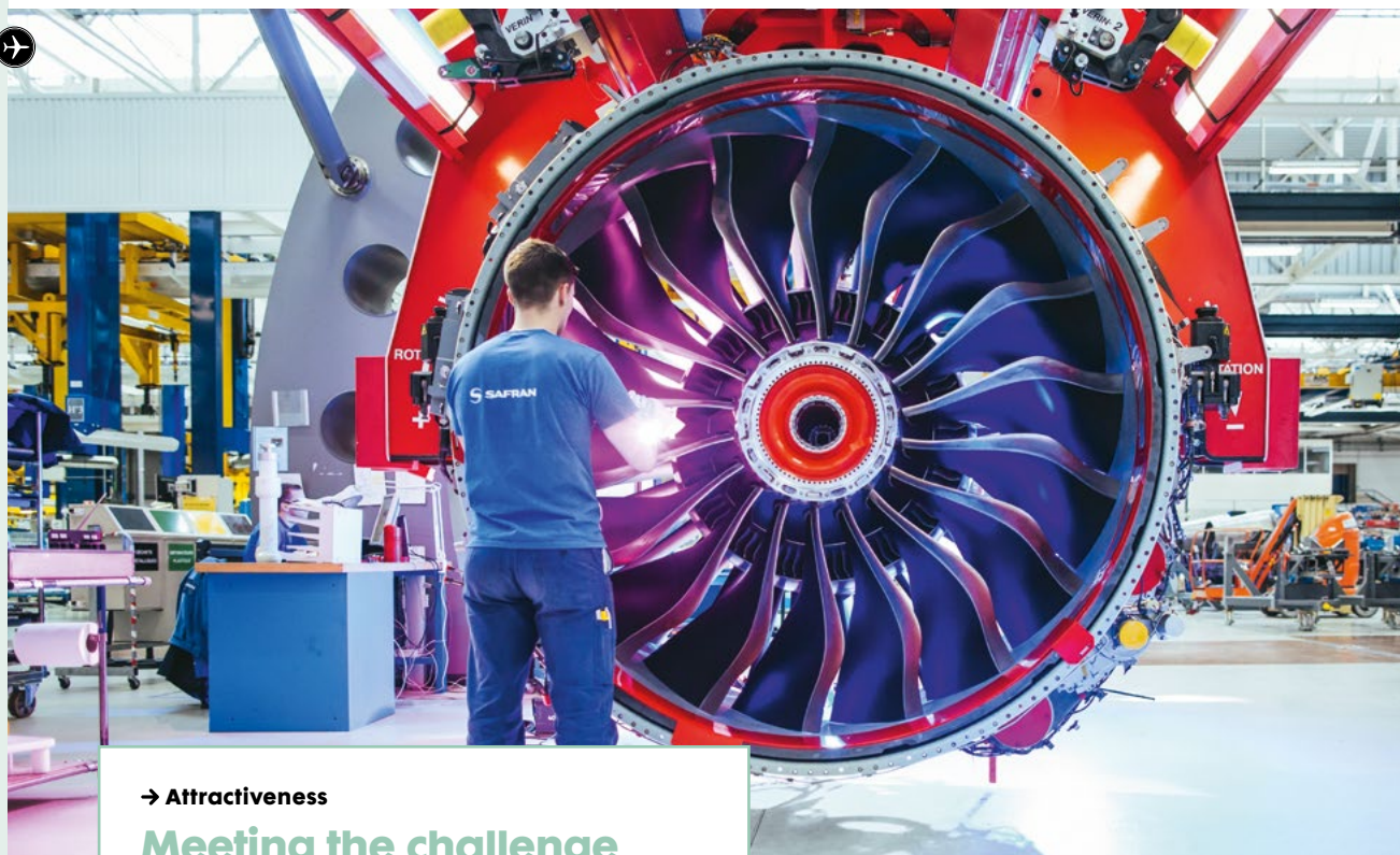
© Cyril Abad / Agence CAPA Pictures