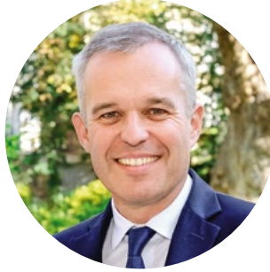
FRANÇOIS DE RUGY Minister for the Ecological and Inclusive Transition