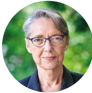
ÉLISABETH BORNE Minister for Transport