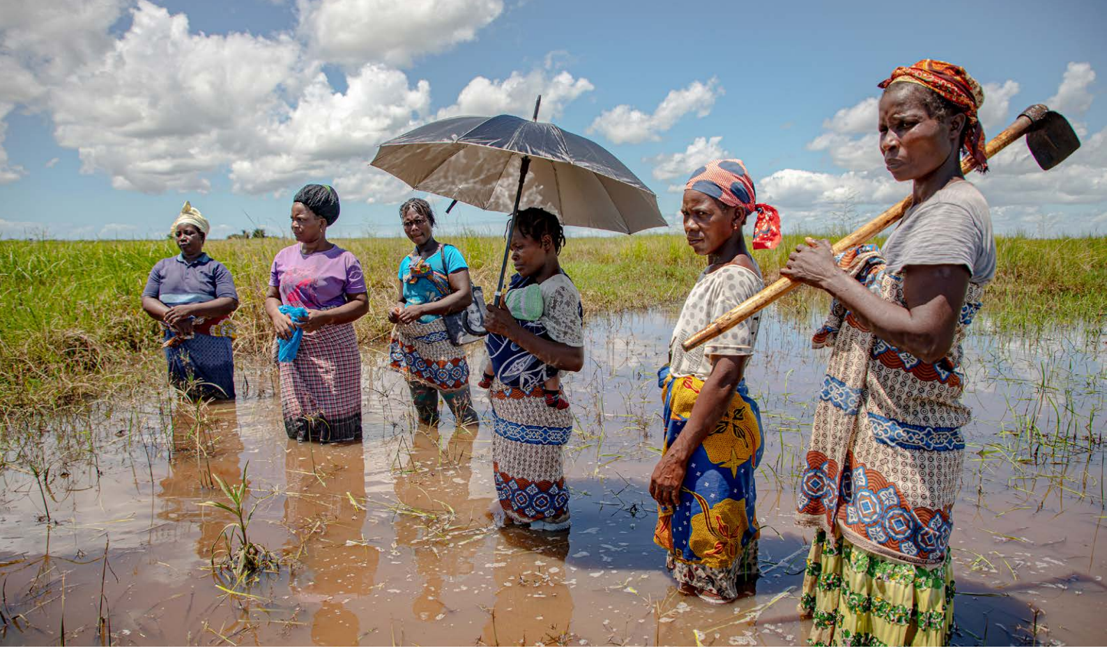
The 2020 floods in Sofala province, Mozambique, came a year after Cyclone Idai and once again destroyed harvests and homes. Policies to help cope with disasters like these must be gender-responsive, to address the particular challenges faced by women.