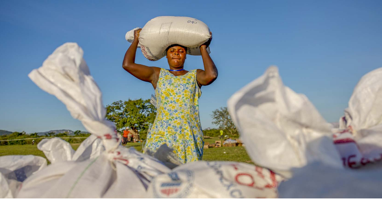
Food aid distribution in Zimbabwe, where 3.6 million people suffered from severe food shortages in 2020.