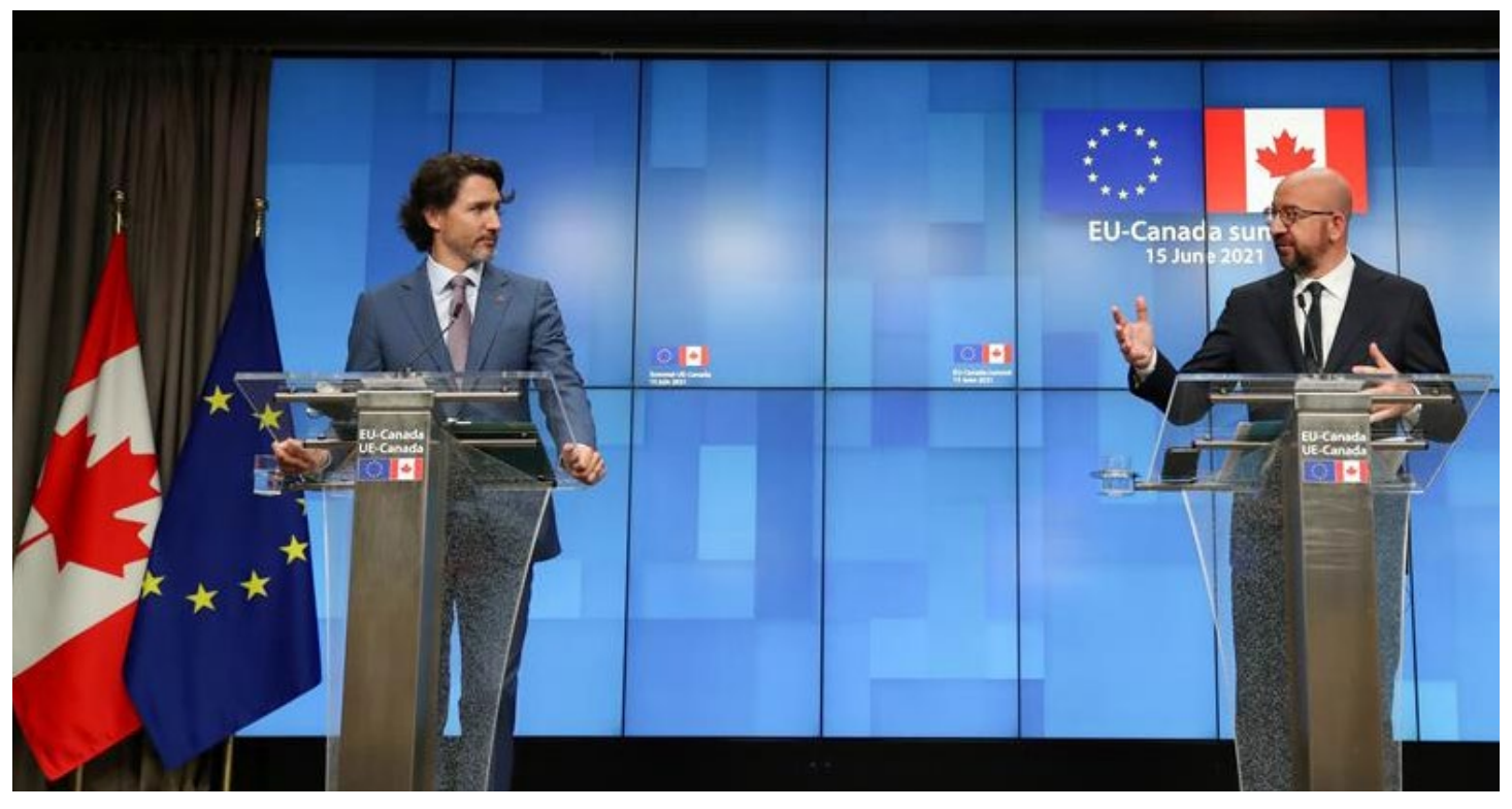
Canadian President Justin Trudeau and European Council President Charles Michel hold a news conference during the 2021 EU-Canada Summit. The EU and Canada are still negotiating a PNR agreement.

and cited by the commission as problematic include "the retention of PNR data, the processing of sensitive data, notification to passengers, prior independent review of the use of PNR data, rules for domestic sharing and onward transfers, [and] independency of oversight..."<sup>30</sup>