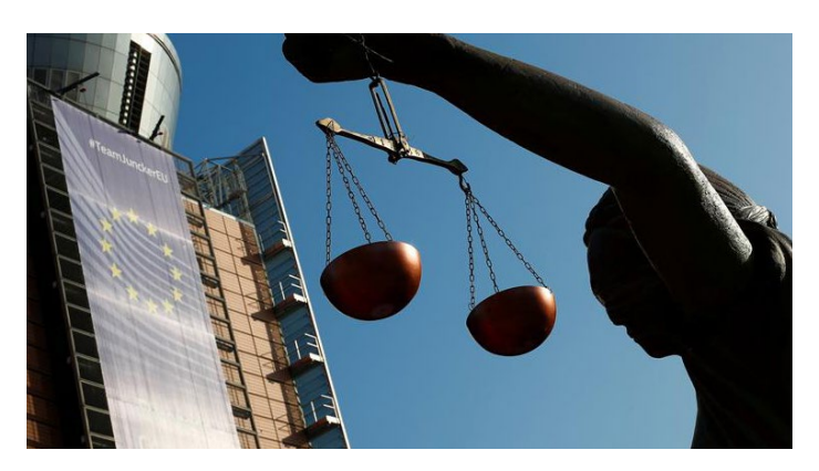
A statue of Lady Justice stands outside the EU Commission during a protest.

In 2015, the European Parliament sought the opinion of the CJEU on whether the Canada-EU PNR Agreement negotiated by the commission conformed to the provisions of the Charter of Fundamental Rights relating to data protection. Two years later, the court ruled that the draft Canada agreement was incompatible with EU law in a number of respects. While the CJEU opinion<sup>23</sup> found that international transfers of personal data for counter-crime purposes in principle were permissible under the charter, it nevertheless determined that a series of provisions of the Canada agreement failed the strict necessity and proportionality test applied to infringements of the fundamental right to data protection under European law. It held that certain categories of Europeans' PNR data were too sensitive to be transferred at all,24 while other categories of data eligible for transfer were too broadly defined.<sup>25</sup> The court also exercised its extraterritorial jurisdiction over EUorigin personal data to insist that Canada conduct judicial or administrative review prior to using transferred PNR data