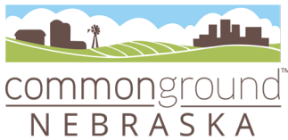
Common Ground Distinguished Business Partner

CommonGround is a national movement of farm women who want to share information about farming and the food they grow. In Nebraska there are more than 40 farm women volunteers who are passionate about bridging the knowledge gap between consumers and farmers. CommonGround has hosted educational events showcasing Nebraska food products to Family and Consumer Science (FCS) teachers, providing them with classroom knowledge to take back to their students. Throughout the school year, CommonGround is a frequent presenter to FCS classrooms across the state, teaching students to be knowledgeable consumers, and to base their food purchasing decisions on food production facts, food safety, farm life and their common ground.