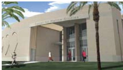
An artistic rendering of the new building

Using marine organisms such as sea slugs, lobsters, horseshoe crabs, jellyfish, coral and the freshwater zebrafish, Whitney investigators work to determine how the human body functions and malfunctions. Their research includes projects to discover how brain neurons are wired, what the sensitive mechanisms of vision and olfaction mean, identifying genes that cripple muscles, mapping proteins with fluorescent markers and finding a safe mosquito larvicide.