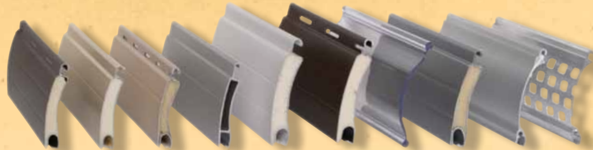
400 Series 420 Series 440 Series 450 Series 500 Series 520 Series 530 Series 540 Series 560 Series 561 Series