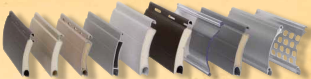
400 Series 420 Series 440 Series 450 Series 500 Series 520 Series 530 Series 540 Series 560 Series 561 Series