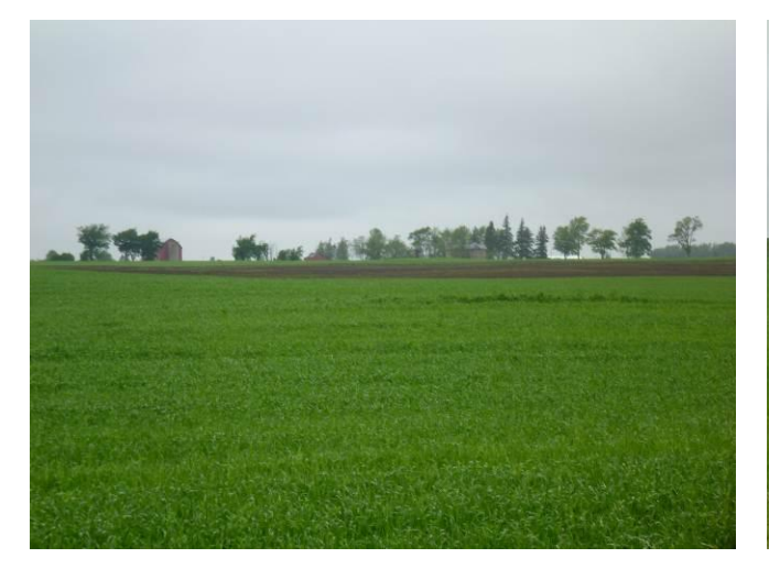
Figure 2-2: Roddick Road, south of Elm Tree Drive

Figure 2-2 through Figure 2-5 are representative of current agricultural land use in the Wind Energy Centre Study Area.