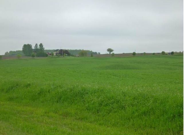
Figure 2-3: Hodgins Road, south of Elm Tree Drive