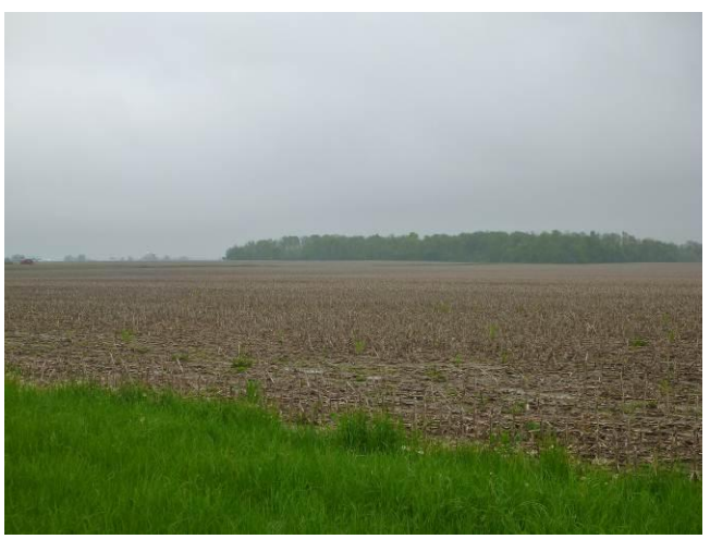
Figure 2-5: Morse Road, north of Egremont Drive