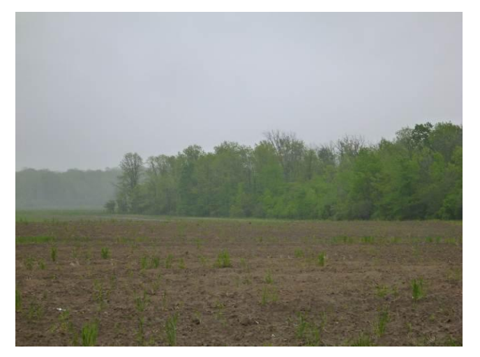
Figure 2-4: Schools Road, north of Egremont Drive