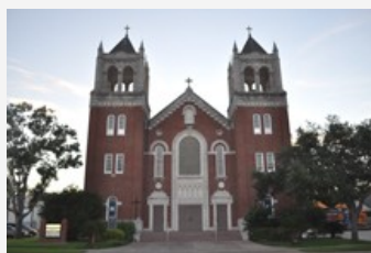
St. Michael's Catholic Church in Cuero

The Winedale Historical Complex hosts its annual quilt exhibition: Red, White, and a Bit of Another color. A Quilt exhibition featuring a selection of quilts from the Winedale Historical Quilt Collection; The University of Texas at Austin. Quilts from the collection date from late 1700s to current dates. Exhibit will be on display from Feb 10-Feb 23, 10-4 daily. FREE