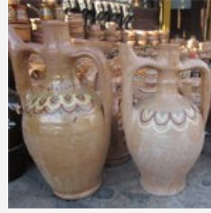
Yett Park Trade Fair in Blanco

Saturday, February 8-March 8. Will continue every 2nd Saturday. 9:00 a.m. – 4:00 p.m. SWAP MEET ARTS & CRAFTS Farmers Market Yett Memorial Park, 1813 US Highway 281, Blanco, TX 78606