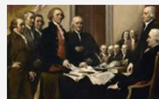
See "1776" in Clute. The decisive event in

Admission: Any single day $35.00, Two days $60.00, Three days $75.00 Prices are good at the door, Any day after 5:00 pm only $20.00 Over 200 RV Hookup $30.00 per day. We accept all major Credit & Debit cards. Reservation are not necessary, except for parties of 8 or more. For information call: 800-243-6502