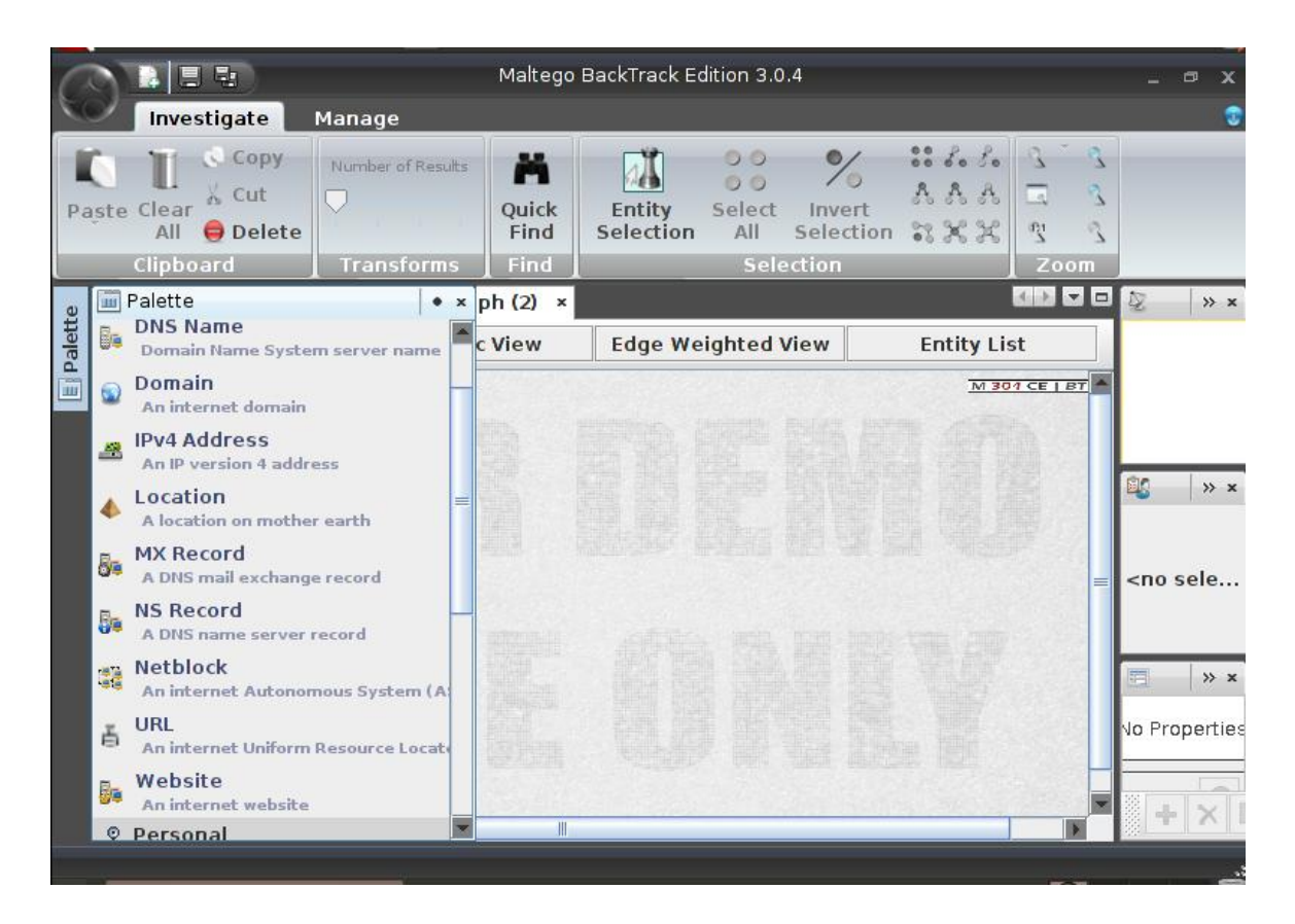
Figure 3: Maltego UI in BackTrack 5

Another interesting and powerful tool is Maltego, generally used for SMTP analysis. Figure 4 of this tutorial shows Maltego in action.