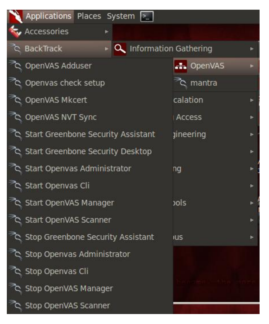
Figure 5: OpenVAS options in BackTrack 5

OpenVAS is a powerful tool for performing vulnerability assessments on a target. Before doing the assessment, it is advisable to set up a certificate using the OpenVAS MkCert option. After that, we will add a new user from the menu in this BackTrack 5 tutorial.