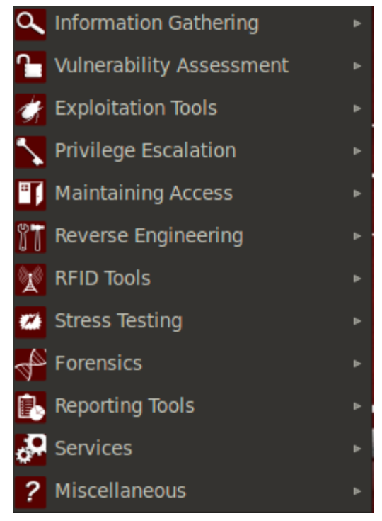
Figure 1: Categories of tools in BackTrack 5

BackTrack 5, codenamed "Revolution", the much awaited penetration testing framework, was released in May 2011. It is a major development over BackTrack4 R2. BackTrack 5 is said to be built from scratch, and has seen major improvements as well as bug fixes over previous versions.