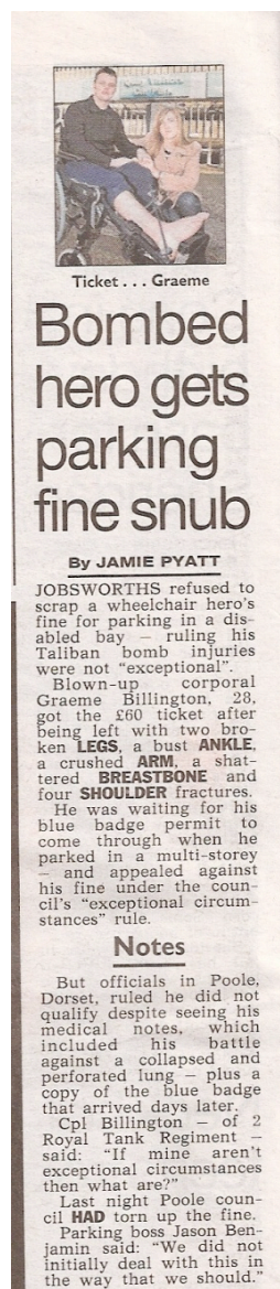
Figure 14: ‘Bombed Hero Gets Parking Fine Snub’ in The Sun (Pyatt, 8 th March 2010).

Labour Force Survey Data from 2001 contrasts with this image; it found that while the ‘want work’ rates for all disabled people were strong (52%), this same figure was far higher with just people with mental health problems (78% of those with “depression” or “bad nerves”, and 86% of those with “mental illness, phobia, panics”) (DWP, Spring 2001: 5). The data revealed that a larger proportion of people with a mental health problem had a desire to work than among disabled people in general, figures the TUC argues may underestimate the problem (October 2004: 10).