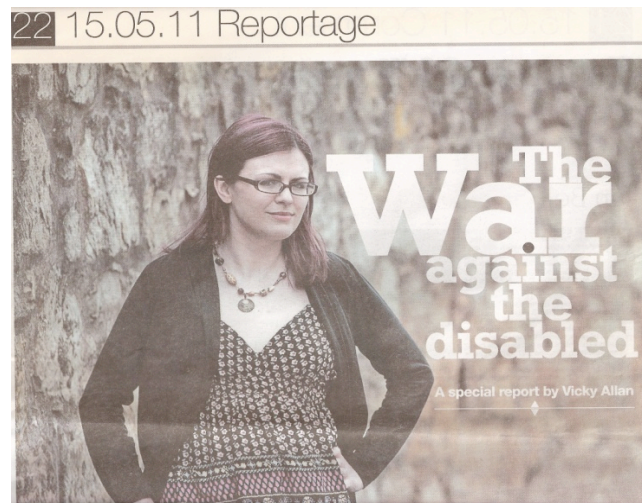
Figure 13: 'War against the disabled' in Glasgow Herald (Alan, 15 th May 2011).

been forced onto the defensive and charities have sought to increase the power of their argument by working together to voice their interests, for example through the 'Disability Benefits Consortium' ( http://www.disabilityalliance.org/dbc.htm ).