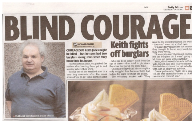
Figure 4: ‘Blind Courage’ in The Mirror (Smith, 24 th March 2011).

“should cast into sharp relief our own gripes and grumbles” (Hardy, 3 March 2011).