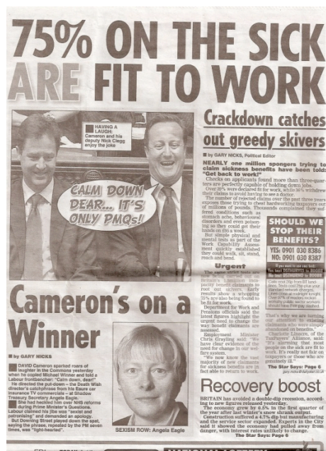
Figure 8: ‘75% on the Sick are Fit to Work’ in The Daily Star (Nicks, 28 April 2010).

There is no debate of the social reality of disabled people’s lives or the political context in which people have come to be drawing this benefit, or indeed whether it is objectively high given the economic context and prevalence of discrimination. Explanation is reduced to individual responsibility and weakened social values (Kavanagh, 4 April 2011).