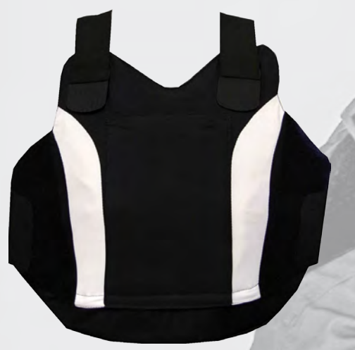
Female Vest - Front View

The FORTRESS-II & IIIA vest is the first in its generation of vests certified under the new "06" standard. While this vest is not as light as some of its predecessors tested under previous standards, it still maintains the softness of those earlier generation vests while providing outstanding ballistic performance and safety margin as witnessed by the extremely high V50 results.