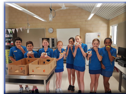
Year 6 school leaders