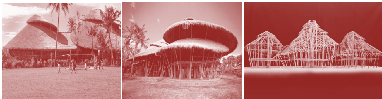
Figure 2: Organic-nautilus shape of HGS building.

HGS implemented the active-structure system with its organic-nautilus shape (Maurina, et al., 2014). The organic-nautilus shell shape is generated to tackle the surface structure by using bamboo pillars to support its battens, rafters, and purlins (Figure 3). The system resembles a tensile structure system while the round purlins help to provide a continuous strength to support the shell shape of the roof. In lieu of the main hall space, a wide-span arches structure system helped to stabilize the