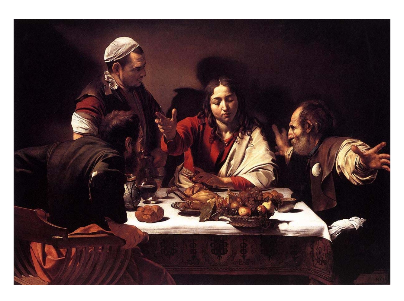
Caravaggio's Supper at Emmaus: Italian Baroque