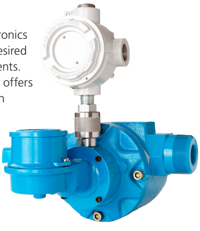
Model 1334 pulse transmitter with optional junction box

Optional NUFLO™ electronics are available to meet desired output signal requirements. As an option, Cameron offers the Model 1334 with an economical powered coil for applications requiring a highamplitude 2V to 24V square wave signal. Electrical certifications for this model are different than those for the standard model.