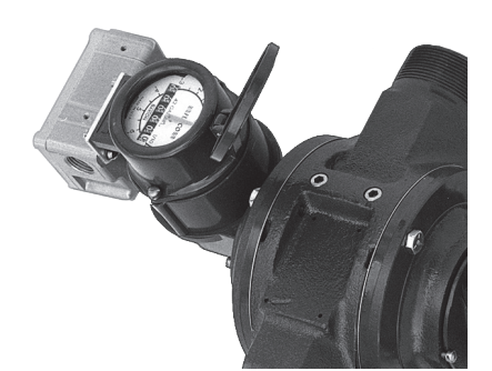
Model 308 pulse transmitter

with a three position terminal strip that is easily replaced in the field.