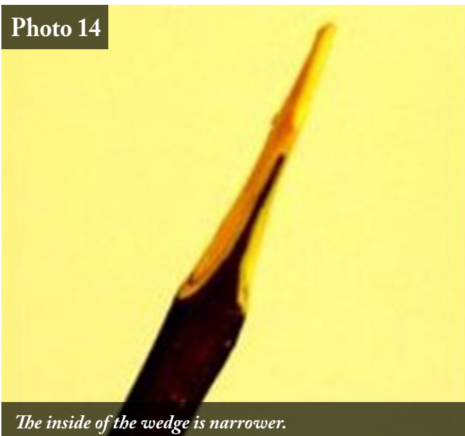
The inside of the wedge is narrower.