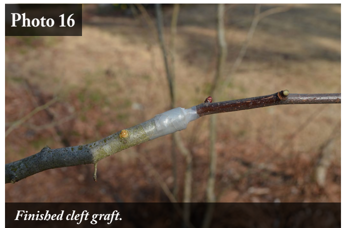
Finished cleft graft.

Six to eight weeks after the grafts begin to grow, cut the tape or film on two sides of the stock away from the grafts. This will allow the tape to eventually peel off, preventing the possibility of girdling. Do not remove the tape; let it peel off naturally.