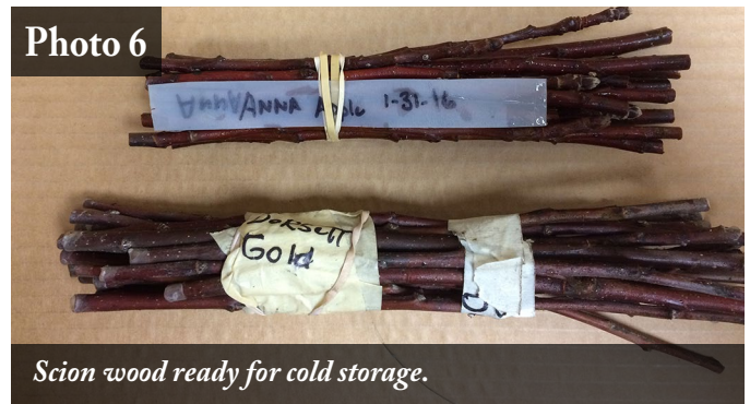
Scion wood ready for cold storage.

To store the scion wood, place each variety in a moist (not saturated) medium, such as sphagnum moss, sawdust, or paper towels, and place in a sealable plastic bag. All bundles should be labeled by cultivar name and date collected. A garbage bag is good for large quantities of scion wood. Do not let the wood dry out. Store the wrapped packages of propagating wood in a refrigerated room at 34–38°F. Properly stored scion wood should remain in good condition until it is ready for use in late winter through early spring.