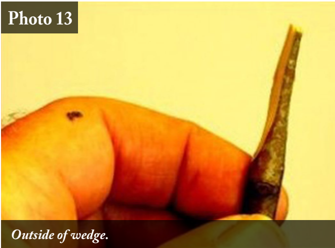
Outside of wedge.