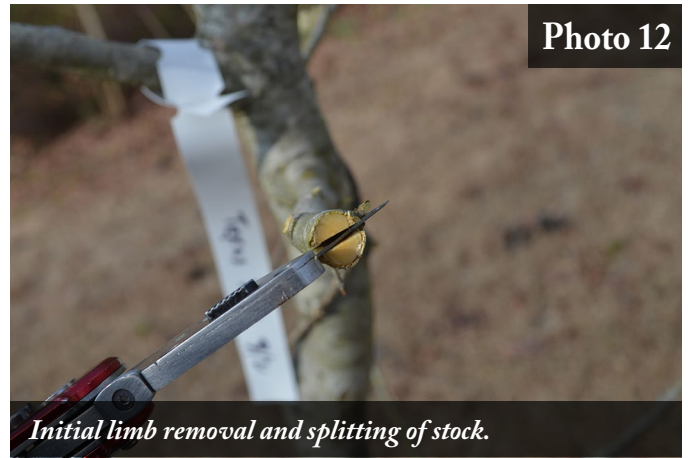
Initial limb removal and splitting of stock.

Insert the scion into the cleft with the narrow side of the scion toward the center of the stock (Photo 15). Gently remove the cleft grafting tool or screwdriver so the stock will close tightly on the scion. Extreme care must be taken to match the cambiums of the scion and stock. Finish by wrapping with parafilm (Photo 16).