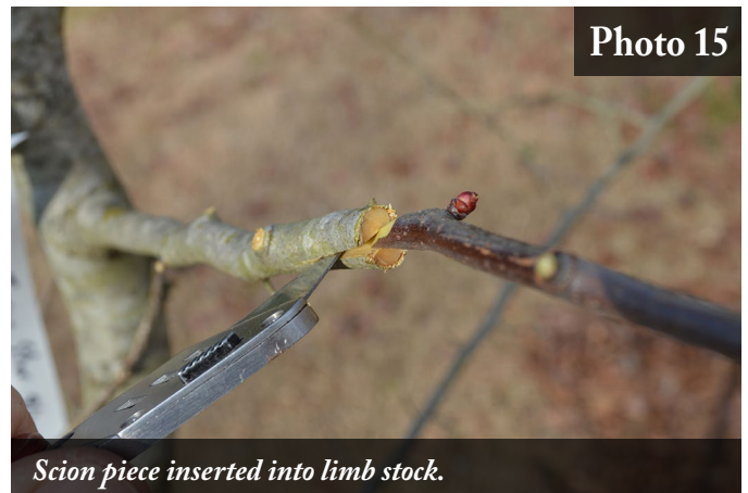
Scion piece inserted into limb stock.