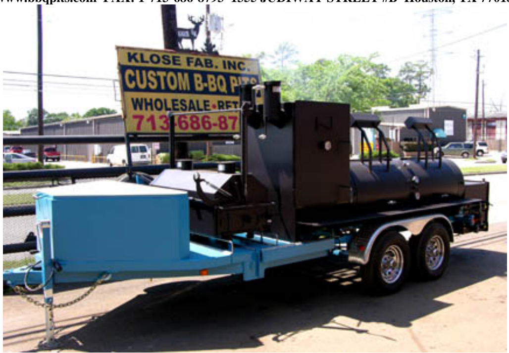
THE ULTIMATE COOKOFF & CATERING RIG (Owner Highly Recommended) Trailer is 6-1/2' Wide with Optional Log rack by 18ft Long. Approx. CAPACITY 3 Row Pullout Shelves ~85 SQ. FT~FEEDS about (400-600)