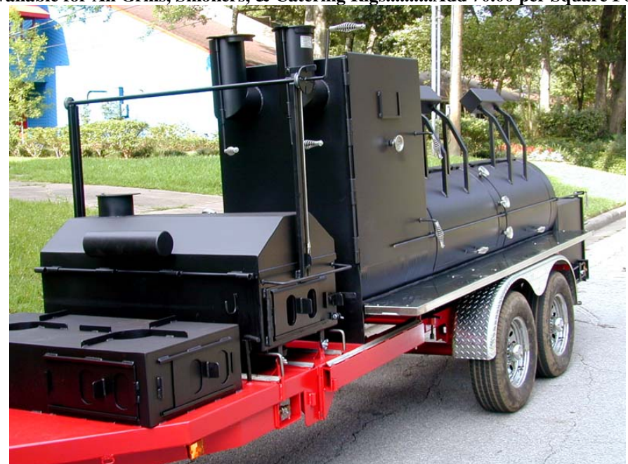
Also Available are 30", 36", 42", & 48" Diameters by 6 to 14 ft Long-Call for Quotes

Or Stainless Steel Meat Racks framed in Stainless Steel Angles. Will Last Forever. Available for All Grills, Smokers, & Catering Rigs......Add 70.00 per Square Foot