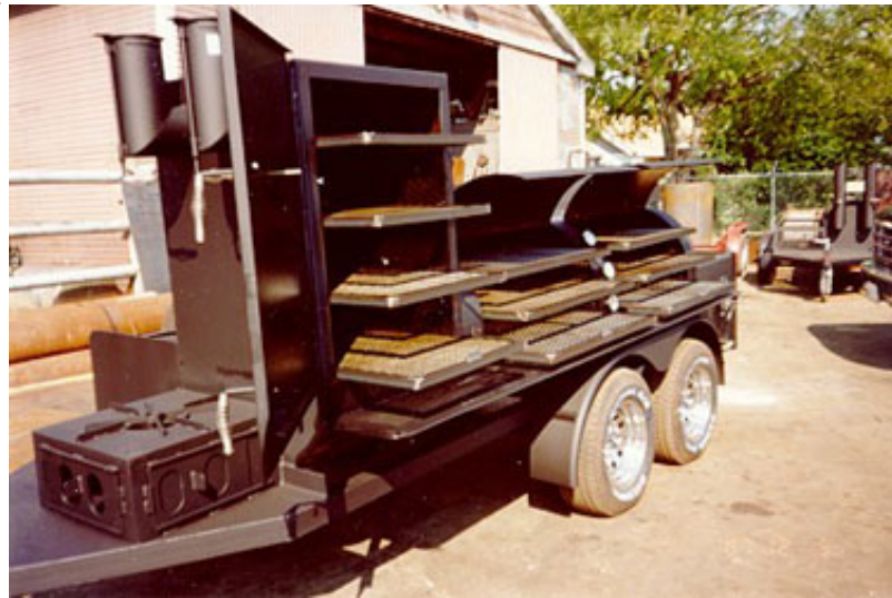
THE ULTIMATE COOKOFF & CATERING RIG (Owner Highly Recommended) Trailer is 6-1/2' Wide with Optional Log rack by 18ft Long. Approx. CAPACITY with 3 Row Pullout Shelves ~85 SQ. FT~FEEDS about (400-600)

30" Diameter x 3/8" thick, 8 Ft. 2-Door Main Chamber, Tandem Axles. 30" x 30" Firebox & 30" x 30" Sq. Upright Slow-Smoker. Dual 6" Smokestacks. Stainless Handles & 2 Stainless Thermometers. Lock-down Rod for Doors. 5,000 lb. Top Wind Jack. Bulldog Hitch. Two 1/4" Safety Chains.12" by 10-1/2 ft. Long by 1/4" Thick Steel Table on Front of Trailer. 2" Drain.