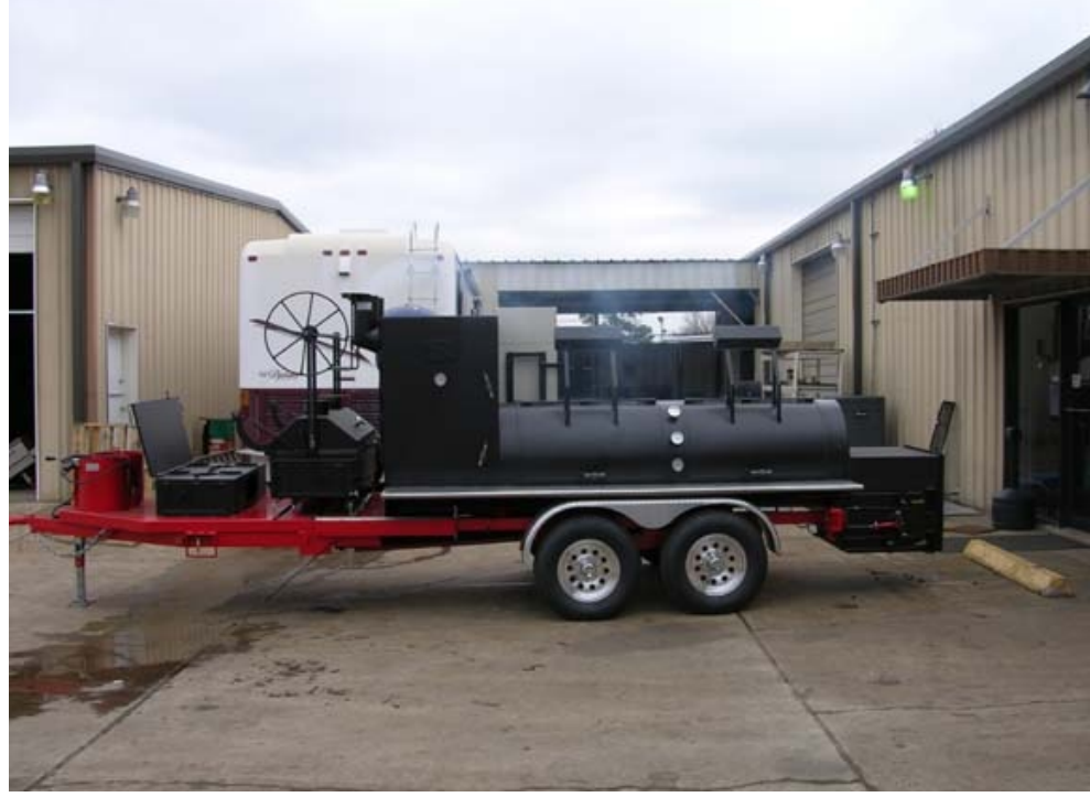
THE ULTIMATE COOKOFF & CATERING RIG (Owner Highly Recommended) Trailer is 6-1/2' Wide with Optional Log rack by 18ft Long. Approx. CAPACITY with Pullout Shelves ~85 SQ. FT~FEEDS about (400-600)