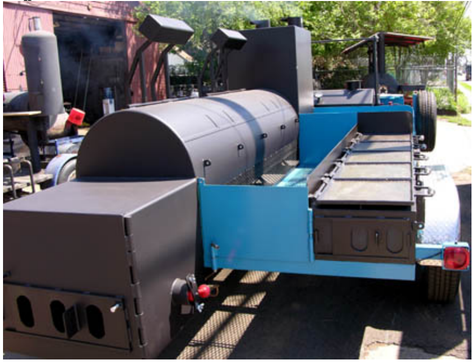
"THE ULTIMATE COOKOFF & CATERING RIG" (Owner Highly Recommended) Five Burners Added to Rear Log Rack for Volume Grilling, Boiling, & Frying. Approx. CAPACITY 3 Row Pullout Shelves ~85 SQ. FT~FEEDS about (400-600)