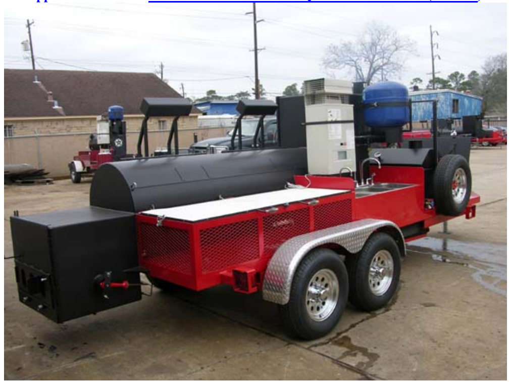
Shown here with Optional Sinks & Sanalite Cutting Boards, Covering Log Rack