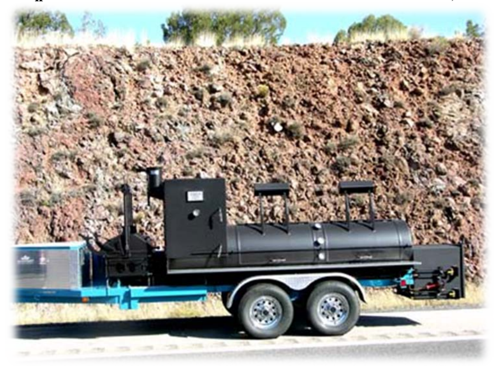
"THE ULTIMATE COOKOFF & CATERING RIG" (Owner Highly Recommended) Trailer is 6-1/2' Wide with Optional Log rack by 18ft Long. Approx. CAPACITY 3 Row Pullout Shelves ~85 SQ. FT~FEEDS about (400-600)