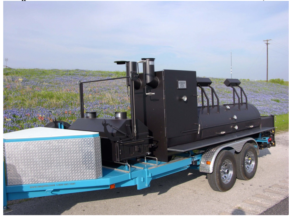
THE ULTIMATE COOKOFF & CATERING RIG (Owner Highly Recommended) Aluminum Covered Storage Boxes/Solid Stainless Steel Front Tables