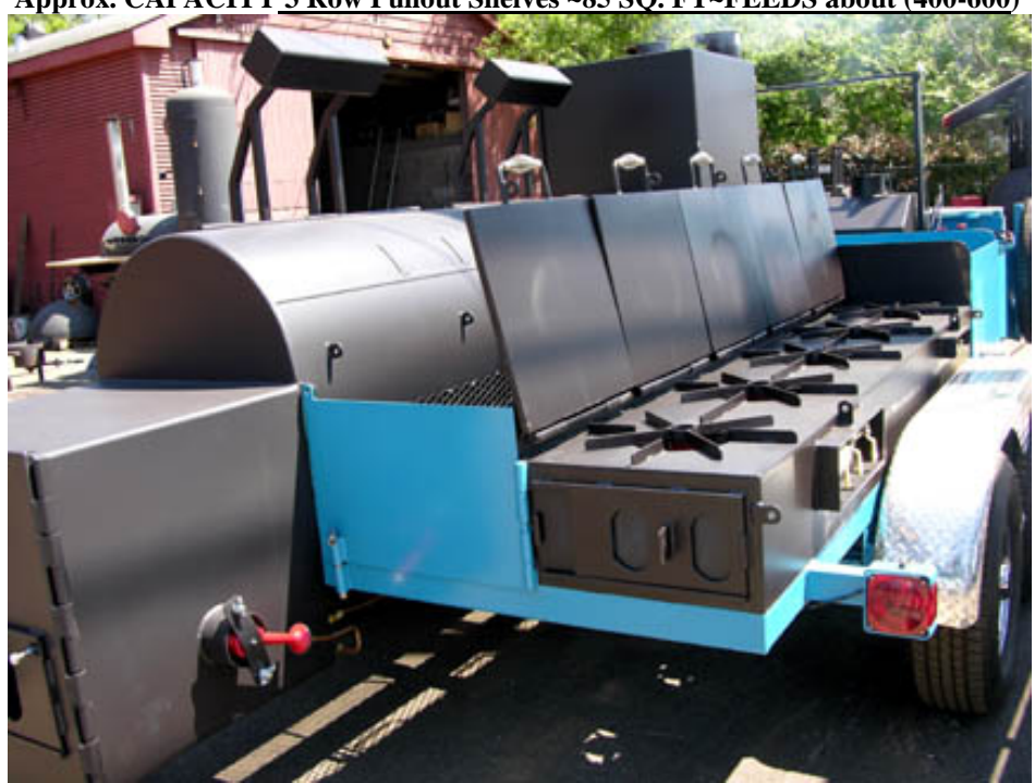
Fold Down Hot Griddle Plates covering FIVE 160,000 BTU Gas Burner Tables