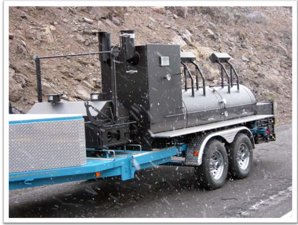
THE ULTIMATE COOKOFF & CATERING RIG (Owner Highly Recommended) BUILT TO OPERATE IN ANY KIND OF WEATHER. Approx. CAPACITY 3 Row Pullout Shelves ~85 SQ. FT~FEEDS about (400-600)