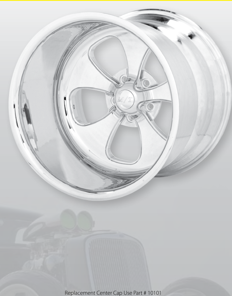
HR-2 IS LIMITED TO QUANTITY ON HAND, WHILE SUPPLIES LAST.