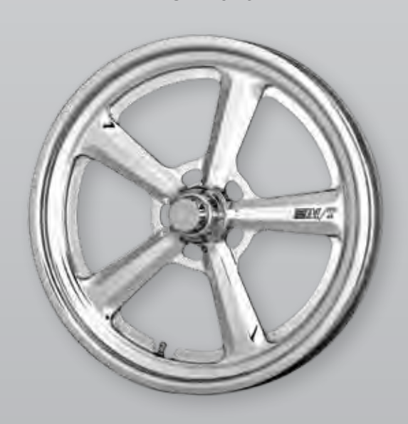
17" Dragster Front