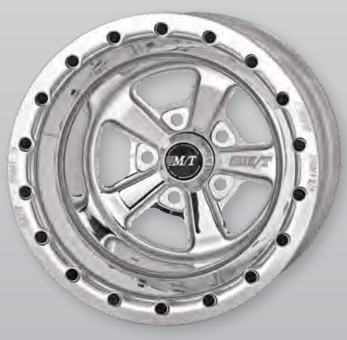
16"X16" Double Bead Lock

World's first one-piece, no weld, fully integrated bead-locks provide state-of-the-art design and function for your drag race vehicle.