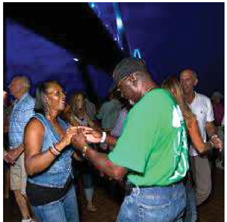
Social Distancing Tisdancing