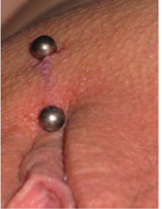
Fig-1: Female genital piercing called "Christina"