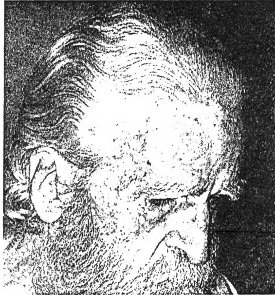
Dom Bede Griffiths will be talking at the Schumacher Lectures in Bristol, weekend of 9-11 October on "Ecology & Human Responsibility." And at Oxford University, Dept. of Divinity, on the 13th October, on "Advaita & Trinity"

And I call this the cosmic revelation. It's the presence of God, of Truth, of Reality, whatever name we give it, which permeates the universe, what Matthew Fox calls Pan-en-theism , God in everything. The ancient religion, really. And that is what, of course, came into, and still remains the background in India today. In India, the world is still sacred. The earth is still sacred. And the water is sacred. To take a bath in the morning they go down to the river and sprinkle the water and consciously think the water comes down from heaven, and Shiva, the god, receives it on his head and distributes it through