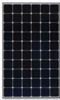
325 to 340W LG NeON 2

Solar panels on roofs of homes generate clean energy by converting sunlight into usable electricity. This conversion takes place within the solar cells and is a process that requires no moving parts.