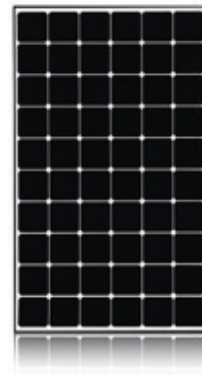
350 to 365W LG NeON R