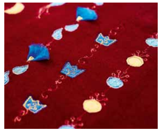
When sewing an appliqué or pop-up stitch, the machine will stop automatically when it is time to insert a piece of decor fabric. Trim all fabric when you are finished sewing the whole stitch.