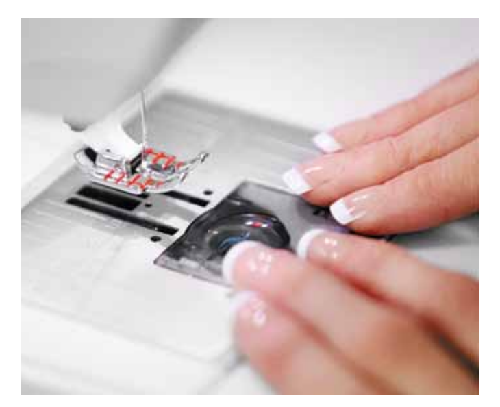
The included HUSQVARNA VIKING® Straight Stitch Plate with sensor technology helps align the fabric beneath the needle to create perfectly uniform straight stitches. Your DESIGNER DIAMOND Royale™ machine alerts you if you try to select a stitch other than straight stitch when the straight stitch plate is attached.