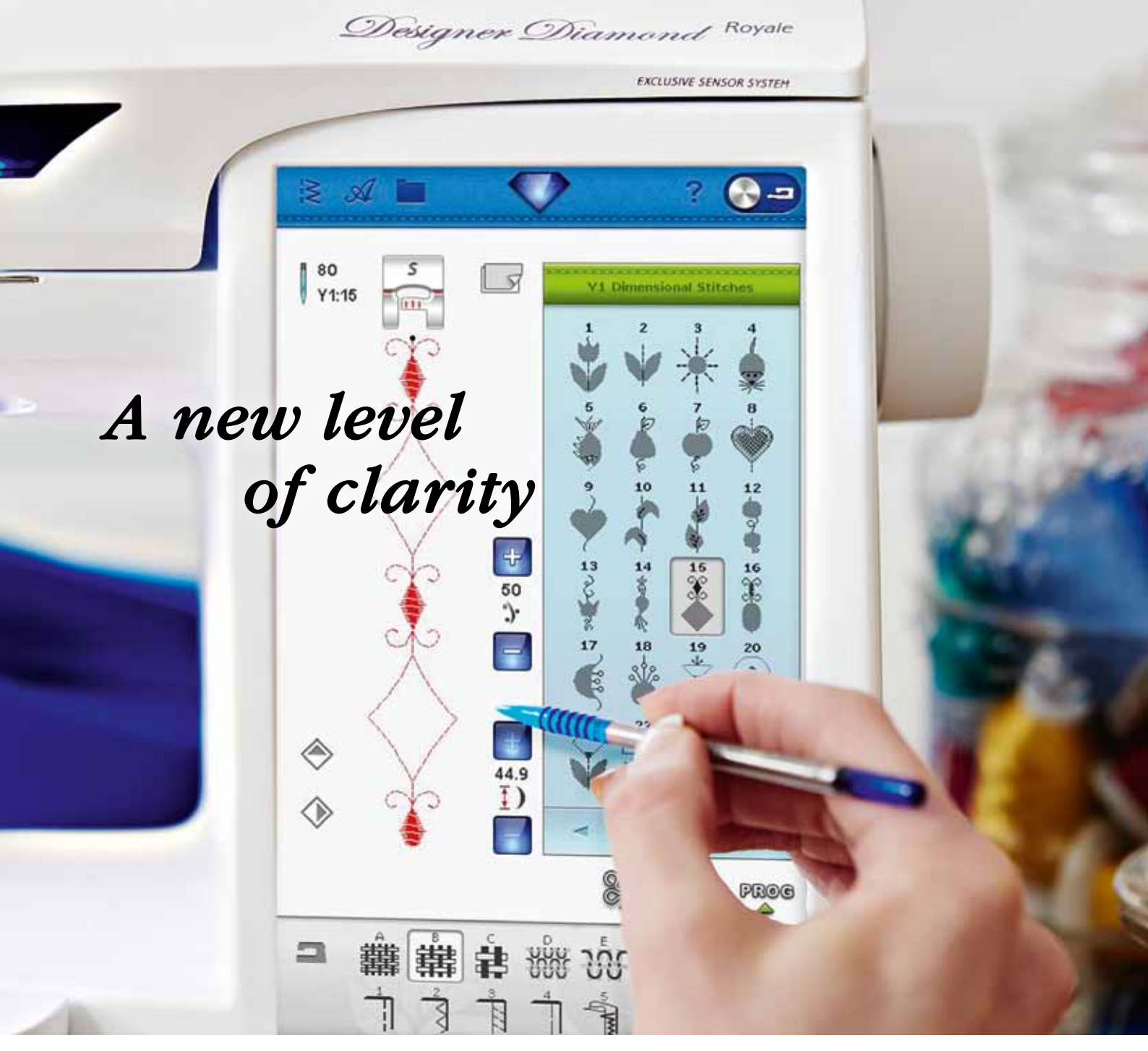
The DESIGNER™ Selection offers endless opportunities to be creative with more than 1,100 beautiful stitches and lettering, up to 54.6 mm wide with Side Motion Stitches, plus hundreds of embroidery designs.

We have challenged ourselves to create the most user-friendly graphical interface. The new screen provides a wider view, clearer colors and more contrast for greater ease of use. It also helps you to navigate more intuitively through the screens for sewing, editing, and embroidery.