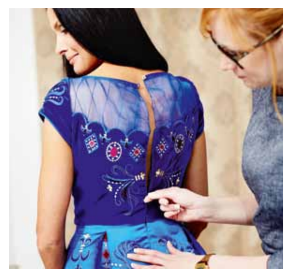
The zipper on the dress was easily inserted using the HUSQVARNA VIKING® Invisible Zipper Foot (optional). Discover more accessories, designed to help you achieve professional results on www.husqvarnaviking.com.