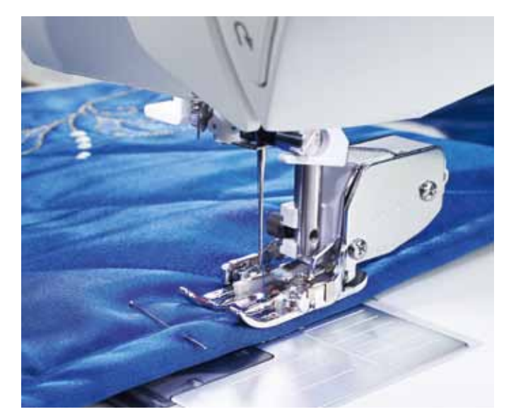
The Interchangeable Dual Feed is designed to feed layers of fabric and batting evenly, creating perfect feeding from the top and the bottom of your quilt.