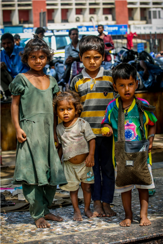
Photo: Dalit children, India

and security, property, freedom from torture and freedom of assembly are regularly violated. And it's getting worse. The annual number of reported incidents against Christians increased more than five times between 2014 and 2019. 7