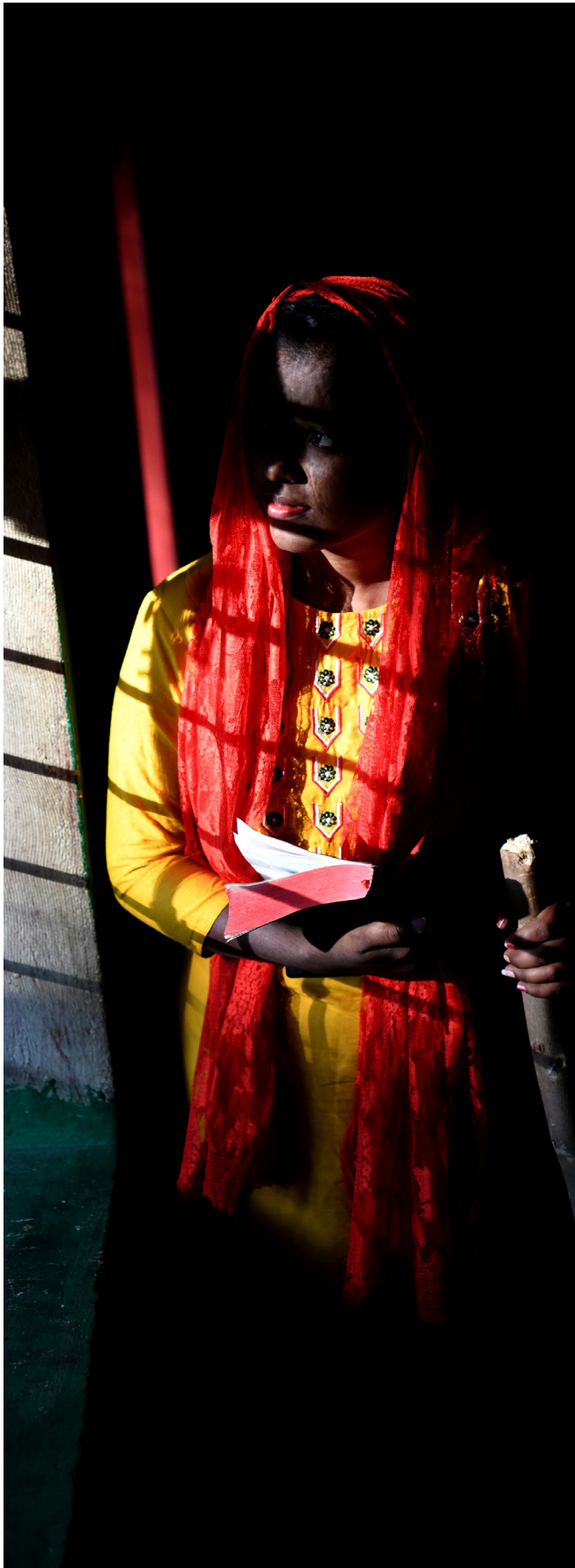
Photo: Re-enactment of the story of Kirti*, a Christian convert from Hinduism whose husband was killed and whose back was broken in a mob attack because of her new faith.

told us: “It is usually women who collect ration cards, fetch water and buy food from markets. Normally you can get water and food within a mile of home but women who have been denied access to local sources may need to walk two or three miles. Women are more vulnerable to abduction or rape when they make longer journeys.”