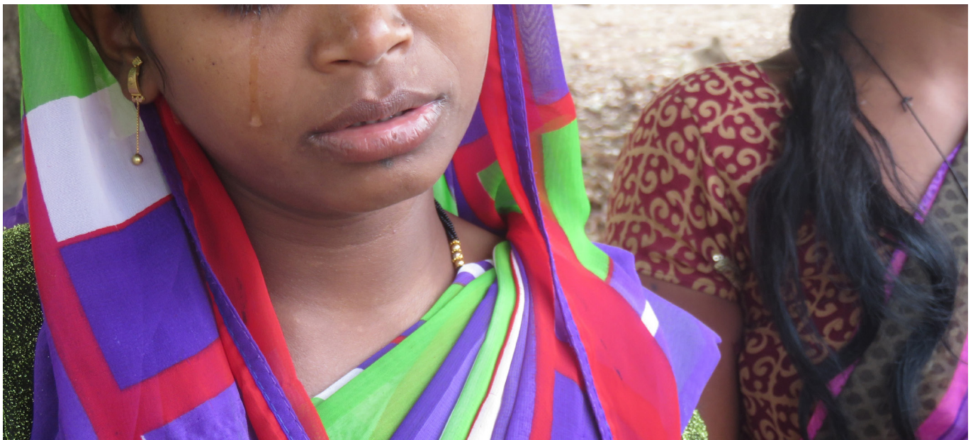
Photo: These women and their families were attacked and chased from their village on account of their Christian faith.

For women, the main Pressure Points according to the 2020 GSRP report are sexual violence and forced marriage (each reported in 84% of countries). These are linked to a woman's perceived sexual purity and dependent position within the family and community. Perpetrators of these abuses aim to damage their victims' reputations and crush them emotionally, binding them in silent shame and fear. Such tactics, often intentionally hidden from surrounding society, are used to