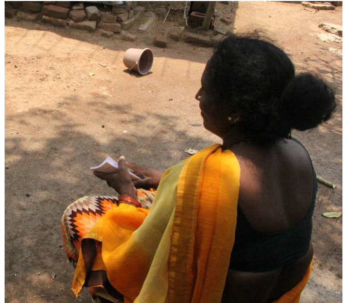
Photo: Neesa* suffered domestic violence because of her faith and had to leave her village due to threats.

According to the incidents reviewed, the second highest cause of death for Christian women (after murder following rape) is domestic violence, which has tragically been normalized to such an extent that many do not consider it wrong. The government has been slow to legislate, only passing the Protection of Women from Domestic Violence Act in 2005. Similarly, incarceration by family , which affected twice as many women than men according to the limited reports received, is seen as normal. Christian women living with Hindu relatives can be prevented from leaving the house, meeting friends, working, studying or accessing healthcare.