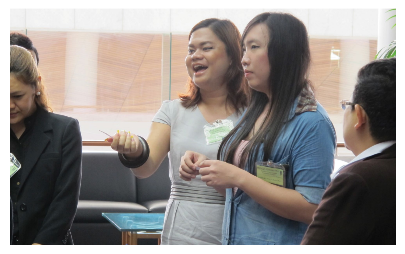
The participants at the national dialogue