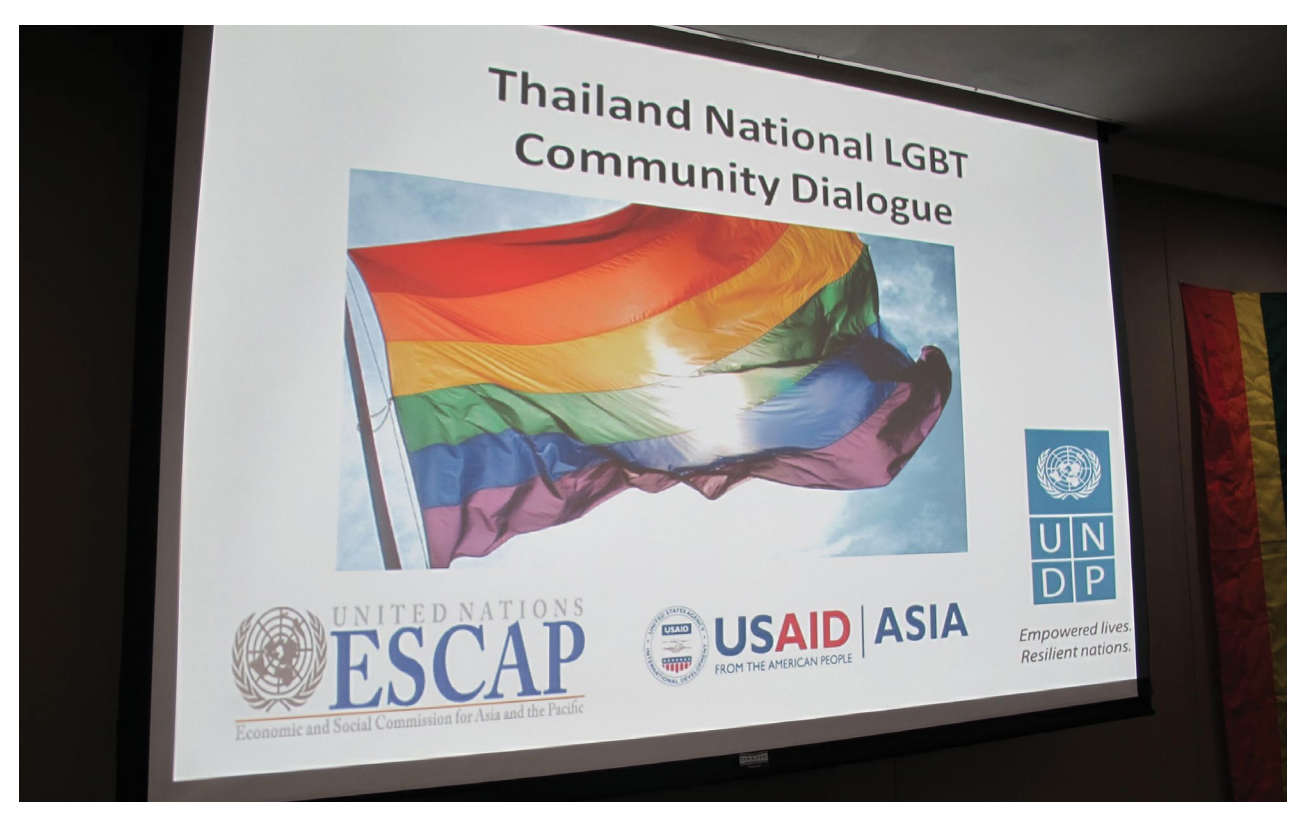
Screenshot of the sign for the Thailand national LGBT community dialogue