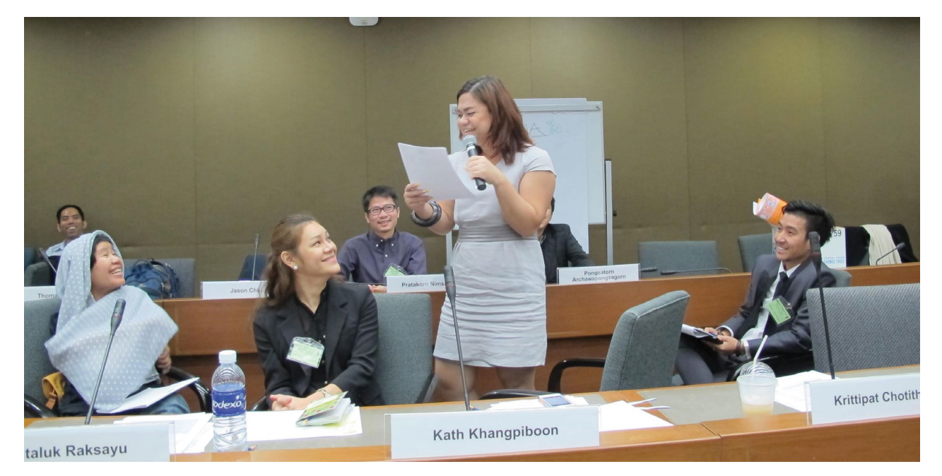
Findings and recommendations of the dialogue being presented by participants

The following section provides an overview of the protection of the rights of LGBT people in six areas: employment and housing; education and young people; health and well-being; family affairs and social and cultural attitudes; media and information and communication technology; and the organizational capacity of LGBT organizations.