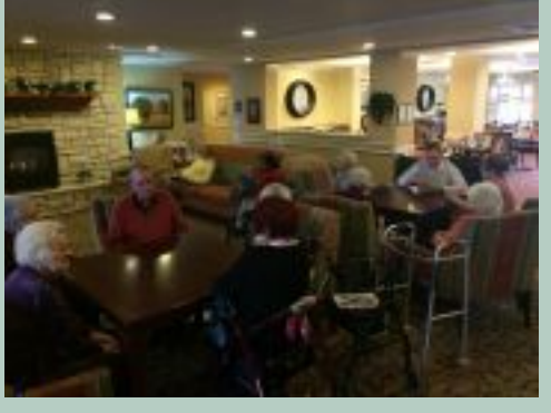
Saturday Card Games!