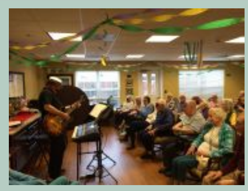
Mardi Gras Party!