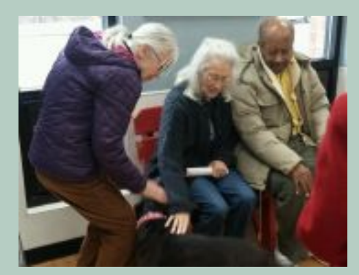
Visiting the Animal Care League!