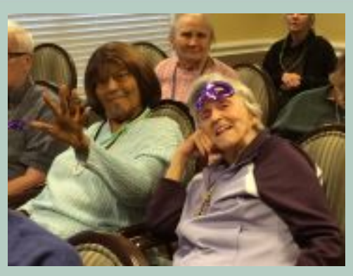
Celebrating Mardi Gras!