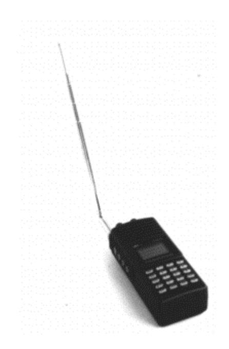
* Swivels TO any ANGLE

Tired of having your handheld scanner always falling over just to keep the antenna vertical? These unique telescopic antennas have an exclusive swivel base that permits the antenna to be mounted on the BNC connector of ANY scanner or radio, in ANY position, and still keep the antenna vertical.