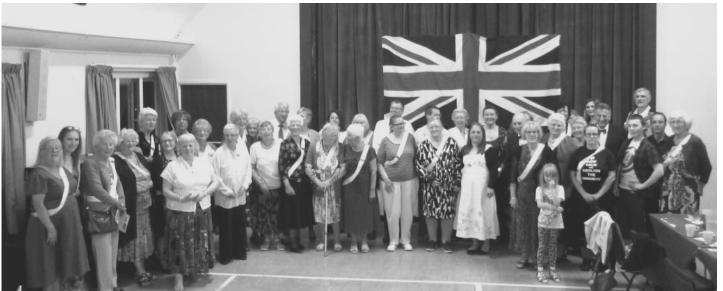
Celebrating Her Majesty's Birthday with an Evening of Royal Elegance