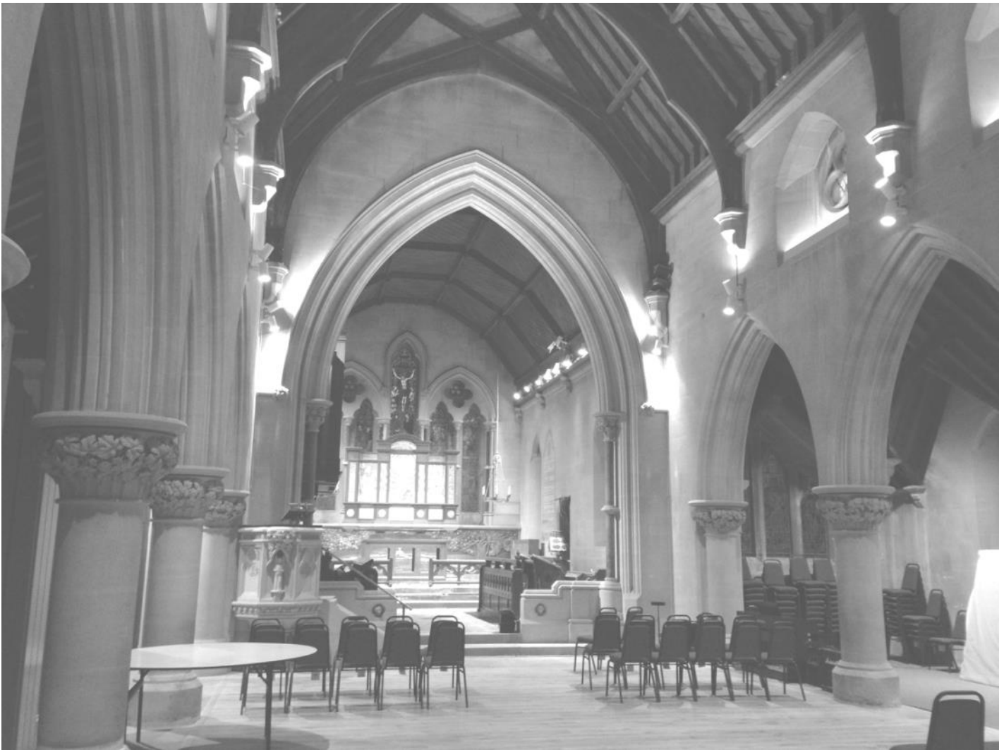
St John's Place - The Centre opens for use