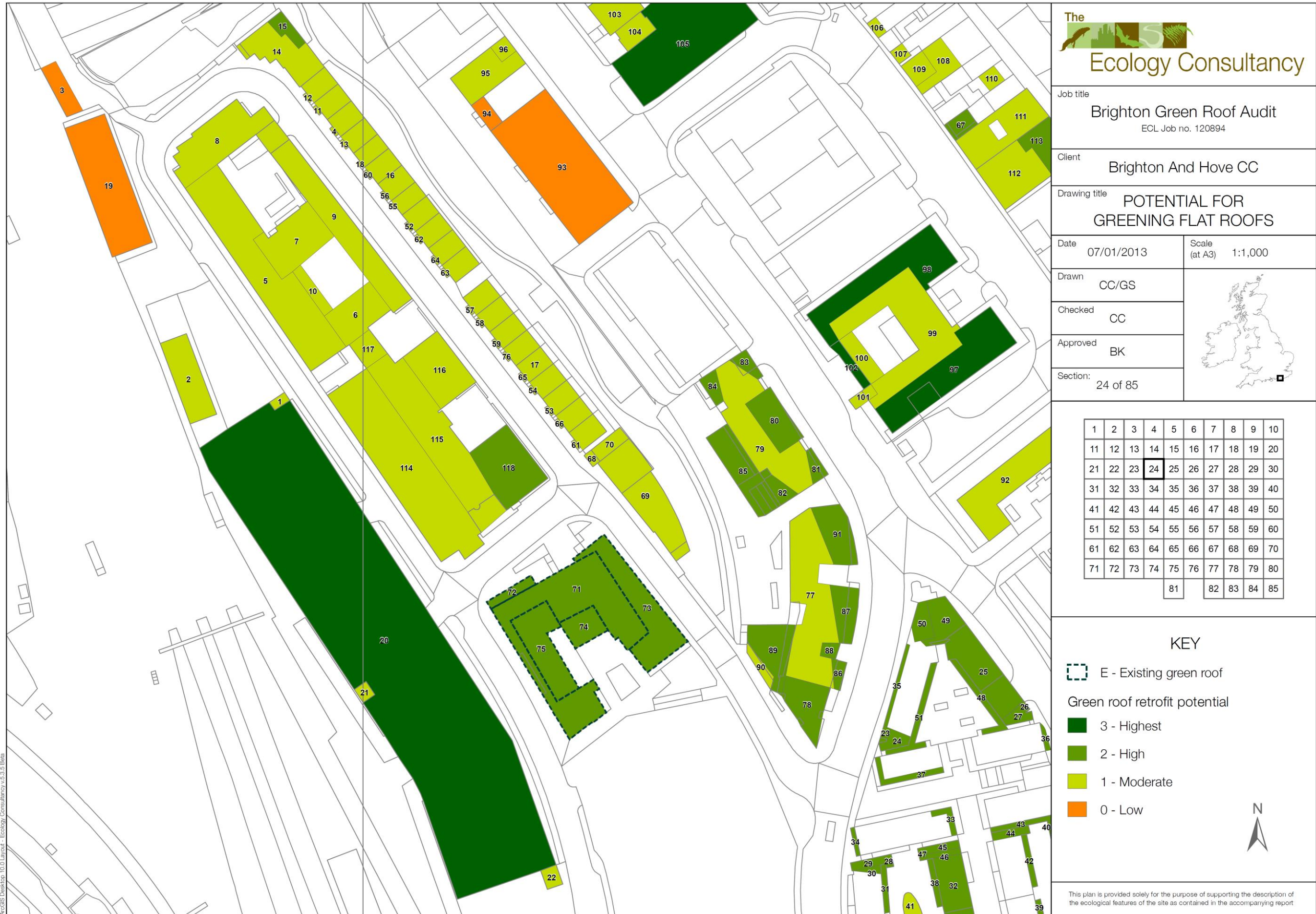
Map 3: Flat Roof Location and Potential for Greening Across the Pilot Project Area