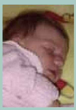
Our online "Care for Babies" workshop has proven to be very popular.

One World for Children is a Registered Training Organisation (RTO) which delivers nationally accredited qualifications from Certificate III to Advanced Diploma level in both children's services and out of school hours care. We train extensively throughout Victoria, specialising in workplace training and assessment and offer online training, nationally.