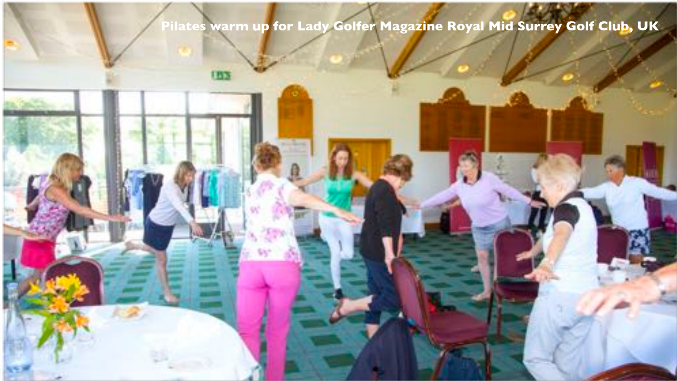
Pilates warm up for Lady Golfer Magazine Royal Mid Surrey Golf Club, UK

The Intelligent Core team is passionate about making golfers healthier & stronger, and guiding golf clubs on how to add fitness services to increase revenue