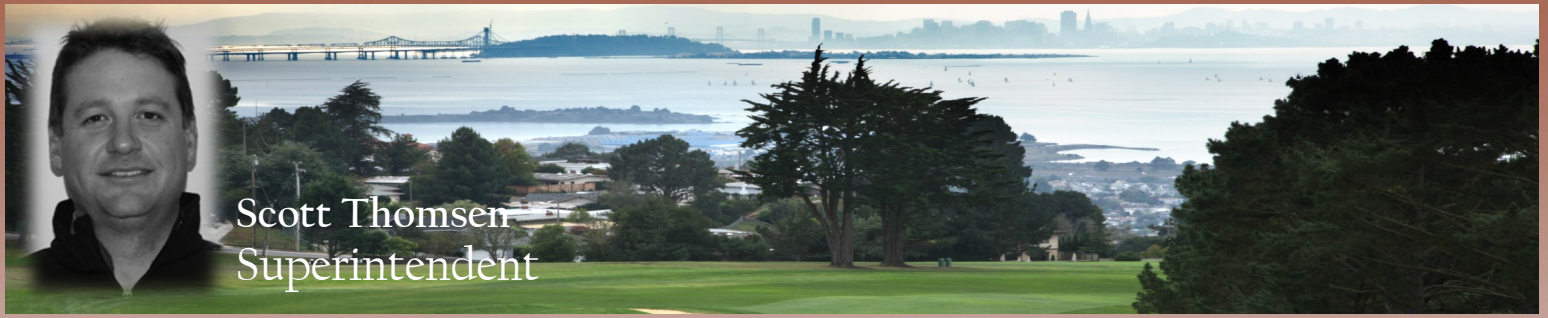
Scott Thomsen Superintendent

There are many different grasses found on golf courses around the world. Usually the grass type found on golf courses is grown because that specific grass is best suited for that climate. Hawaii, Arizona and the southern half of the US is where warm season grasses such as Bermuda grow best. In the cooler climates such as coastal and northern regions, cool season grasses such as Rye, Fescue and Bentgrasses are grown. The one grass that grows in all regions and is found all over the world is the ever hated Poa plant. Poa has even been found on Antarctica. Poa is a cool season annual grass. Its common name is Annual Bluegrass but it was coined "Poa" by golf television commentators, who shortened its full botanical name from Poa annua . It is an annual plant meaning that it puts out seed, dies and then germinates on a yearly basis. This is the reason it is such a hated grass. Most plants and grasses grow best during the warmer months, when root growth is most prevalent. During the winter months plants' and grasses' roots shorten and they either go into dormancy or growth is slowed dramatically. Poa is the exact opposite. It grows best during the winter months and thrives in wet conditions. During the spring as it gets warmer, Poa goes to seed and its roots shorten to almost nothing.