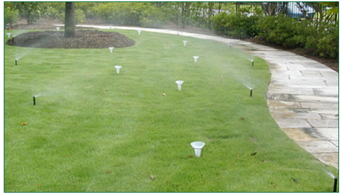
Figure 2. Irrigation audit being performed in a home lawn

Another method, which uses water responsibly, is to use evapotranspiration (ET) rates as a reference point for scheduling irrigation. The Texas ET network ( http://texas-et.tamu.edu ) provides evapotranspiration rates through-