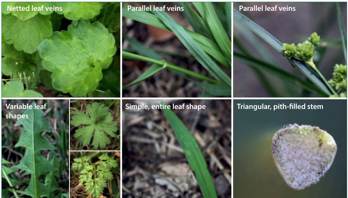
Figure 4. Various leaf shapes (left, broadleaf; middle, grass; right, sedge)