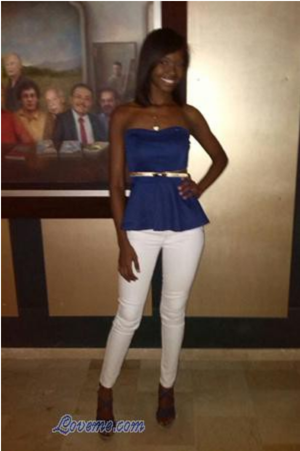
(Caption: Local Barranquilla woman posing)