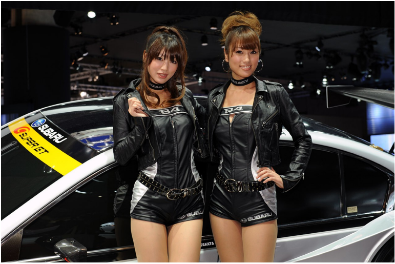
(Caption: Tokyo women posing at car show)

Japanese women are very shy and won't often show their interest. Many barely speak English as well. If you go to the Roppongi area at night, most girls there