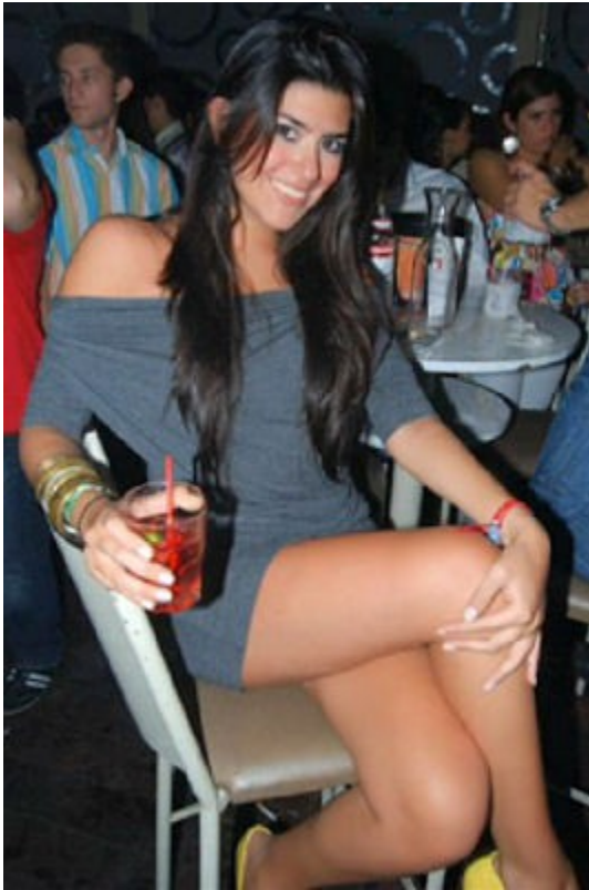
(Caption: Local Panamanian women at bar)

The city has lots of nightlife and clubs on the main street. It's easy to meet and date beautiful Panamanian girls. They are very friendly and enjoy flirting. Learning Spanish is a big plus, although you will find many women that speak perfect English due to the influx of English speaking tourists.