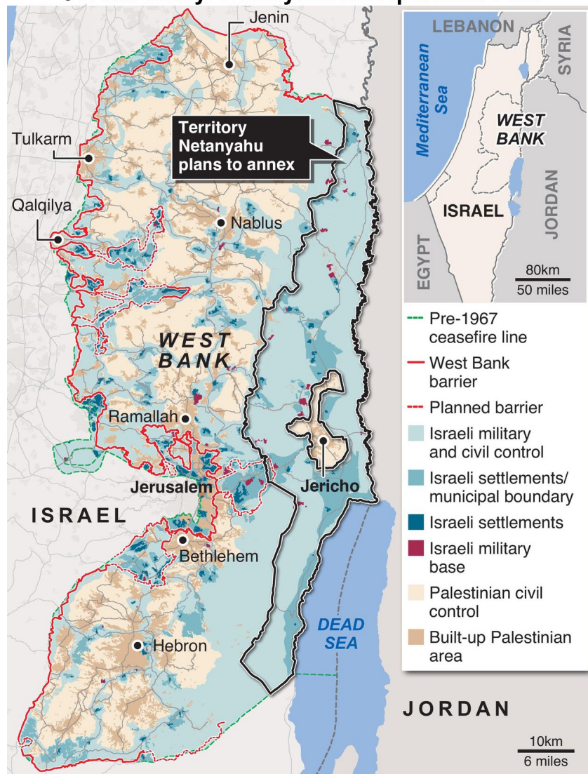
Map credit: Graphic News