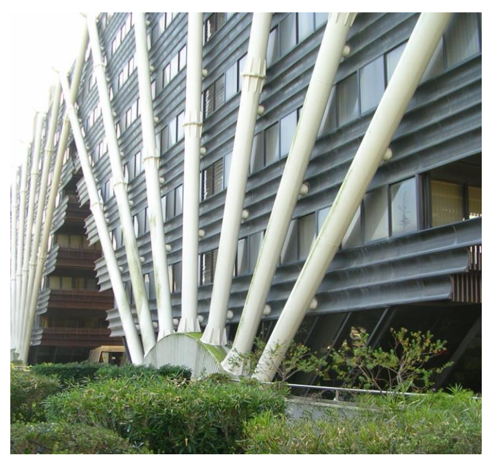
Figure 2 - Fire Protected External Steelwork. Project: Torri Esso – Rome, Architect: Julio Lafuente.