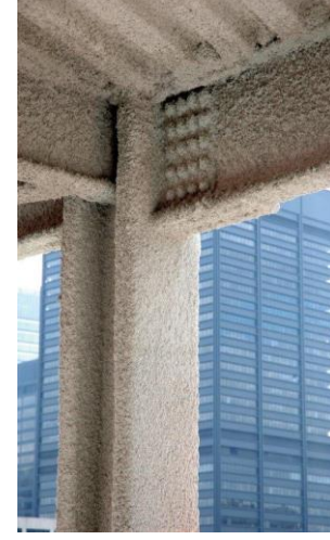
Figure 3 – Steelwork Fire Protected By SFRM Coating System

SFRMs are used to passively delay (or prevent) the failure of steel and the spalling of concrete in structures that are exposed to the high temperatures found during a fire. SFRMs thermally insulate the structural steel members and concrete to keep them below the temperatures that cause failure and / or spalling.