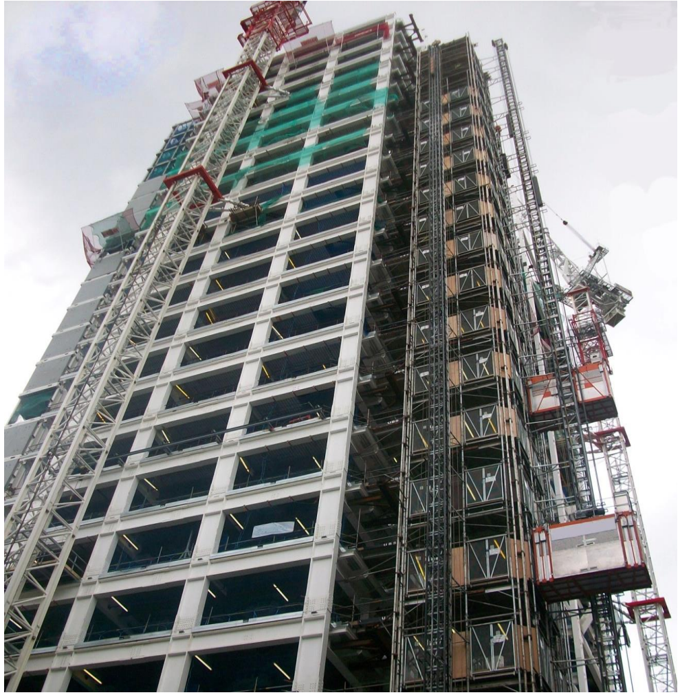
Figure 1 – Steelwork Fire Protected By Intumescent Coating System