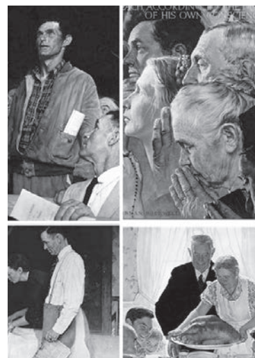
Detail from the Collection of Norman Rockwell Museum.

We are and should be proud examples of what Norman Rockwell pictured with his illustrations of the Four Freedoms—The Freedom from Want, The Freedom of Speech, The Freedom of Worship and The Freedom from Fear!