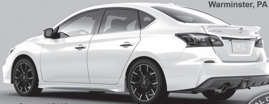
2018 Nissan Sentra NISMO