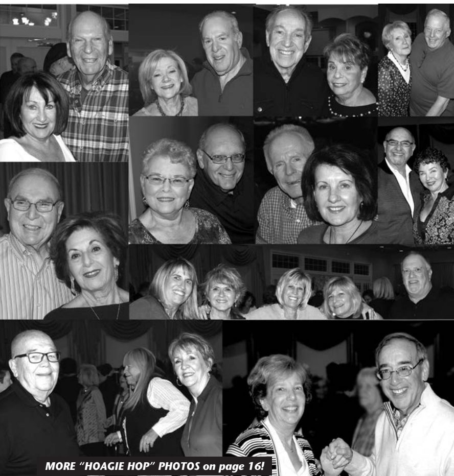
MORE "HOAGIE HOP" PHOTOS on page 16!