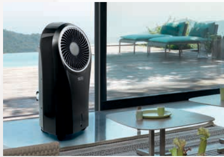
Evaporative Coolers For cool, crisp air.