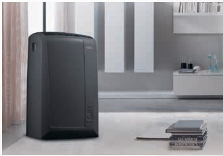
Air Conditioners For cooling larger spaces.

The homes of today have changed in design and how we use them. From open plan living spaces to smaller entertainment areas such as media rooms; the functional needs of families today require unique, tailored solutions. No matter your household needs, De'Longhi has a portable solution that will keep you cool this summer – with a lasting quality that only comes with a De'Longhi product.