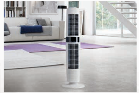
Fans For cooling smaller spaces.