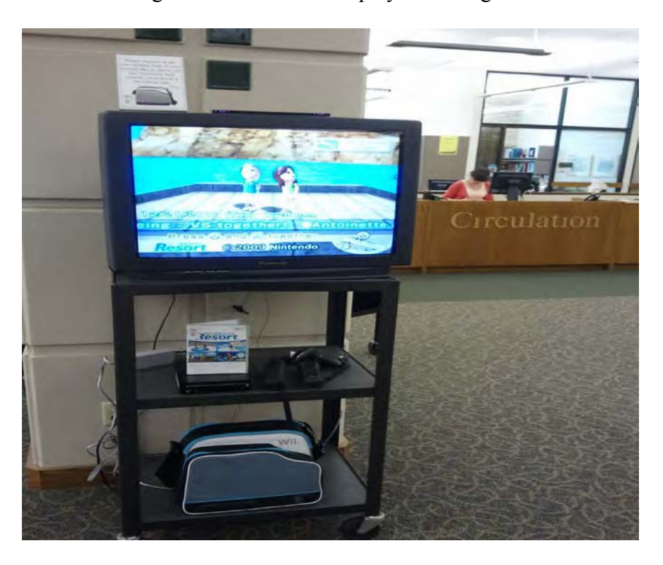
Figure 6. A kiosk with a playable Wii game

patrons aware of the availability of games in libraries is through advertising and outreach. Social media such as Facebook, blogs, and Twitter are a great way to share news with patrons. In an academic setting, student groups and residence life staff can be notified of how they may check out materials for their own programming, and professors can be notified of possible ways to integrate gaming into their curriculum. For example, many online games like World of Warcraft , RuneScape , and Second Life draw players from other countries. Students in a foreign language course could play and converse in the language they're studying.