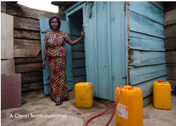
A Clean Team customer

+ Sharing Knowledge Beyond a Single Project: Framing the partnership in a clear and formal agreement with specified terms and commitment is important, but how the sides viewed the partnership beyond the official arrangement largely determined how successful it would be. In this case, both WSUP and LIXIL saw it as an on-going collaboration to achieve the same long-term goals, and for this reason their relationship and exchange of information didn't end with the development of the first-generation prototype and installation. Both sides continue to exchange information and feedback for the purposes of product and business development.