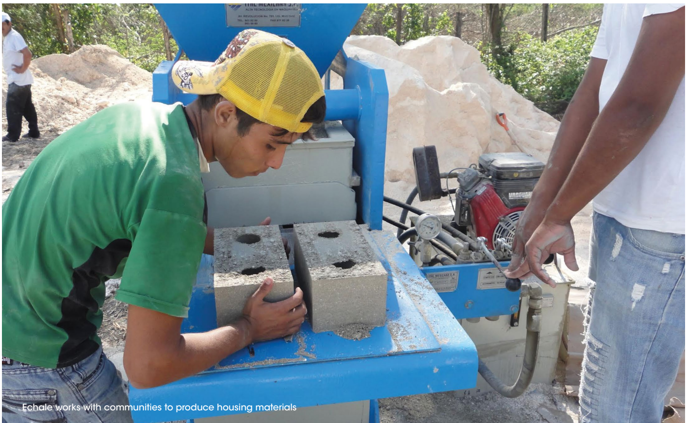
Echale works with communities to produce housing materials

As the relationship with their former cement supplier was clearly breaking down, Echale began to look for another supplier partner and immediately thought of this company, reaching out to their office in Mexico. The local Mexico office did its best to open up communication on the proposal. However, it was only when Echale's CEO met a member of the senior management in the cement company's headquarters that the partnership gained traction and was launched. After a year of talks between the two parties, the partnership was finally firmly established in 2016.