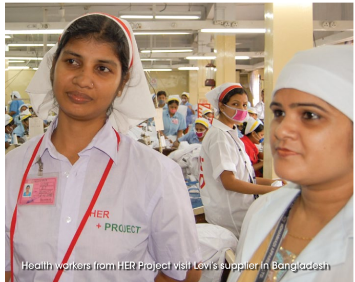
Health workers from HER Project visit Levi’s supplier in Bangladesh

Like others in the industry, LS&Co.’s suppliers were aware that turnover and absenteeism among workers in their factories was high. This gave the impression to factory floor managers that workers were flighty or uncommitted, which then decreased their incentive to invest in or support the professional or personal development of their workforce.