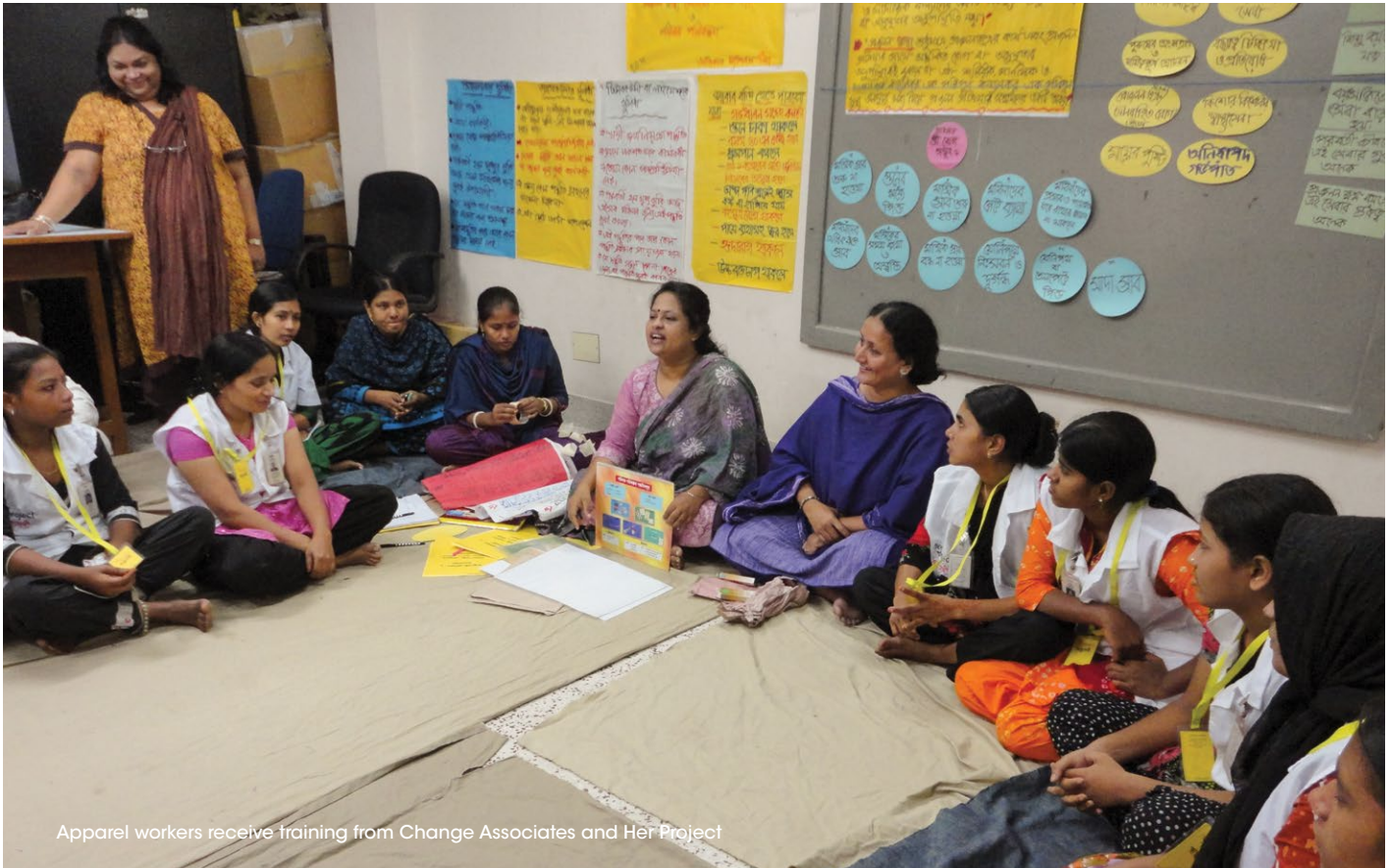
Apparel workers receive training from Change Associates and Her Project

empower factory workers as well as train supervisors and managers on how to engage with workers to increase overall productivity. Levi Strauss Foundation convened and facilitated conversations between LS&Co.'s corporate representatives, the vendor factories and Change Associates. At first, the pilot vendor was largely sceptical, due to previous negative experiences with confrontational NGOs, and it took several meetings before a sense of trust emerged and factory management allowed Change Associates staff to enter its factories.