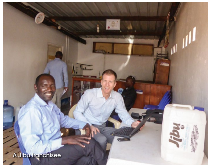
A Jibu franchisee

charging 10-15% of the fees normally billed to larger, conventional companies – an arrangement referred to as “low bono”. EGS projects are full-time, tailored to clients and delivered by consultants on the ground – who are either based locally, or are based with the enterprise for the duration of the project. The EY consultants who are deployed deliver