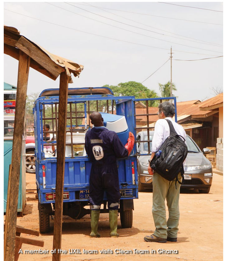
A member of the LIXIL team visits Clean Team in Ghana