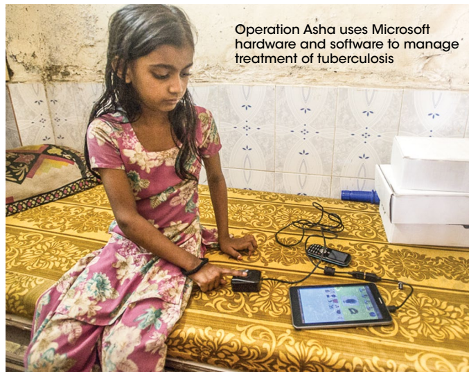
Operation Asha uses Microsoft hardware and software to manage treatment of tuberculosis

+ Data for Social Innovation: The partnership represented a unique opportunity to innovate for a difficult-to-reach market and thereby gain insights into the role of technology in low-income communities. For Operation ASHA, collaboration with Microsoft gave it access to the most accurate real-time data on DOTS, improved efficiency, and new insights on how to improve their incentive scheme and empower community health workers through improving their skills with technology.