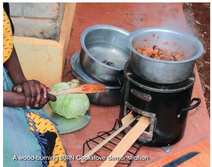
A wood-burning BURN Cookstove demonstration

Through Unilever's local Kenyan bouillon brand, Royco, BURN aims to reach tea farmers with communication on how to cook nutritious and healthy meals for them and their families. The BURN partnership complements the work that Unilever is doing with the Global Alliance for Improved Nutrition (GAIN), where they have created a global Nutrition