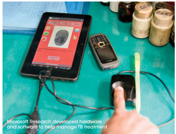
Microsoft Research developed hardware and software to help manage TB treatment

networks become more established, and more bilateral partnerships feed into them, the future may hold more complex, but also more efficient and resourceful, partnership-to-partnership and multilateral engagements. The Skoll Centre and Acumen are committed to supporting this expanding networked approach.