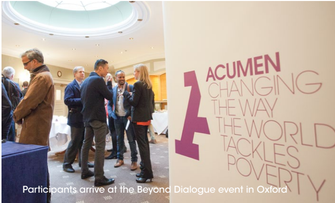
Participants arrive at the Beyond Dialogue event in Oxford