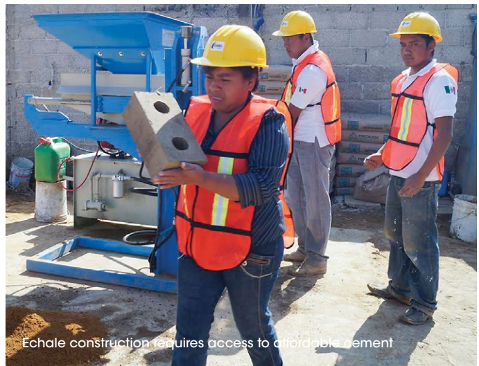
Echale construction requires access to affordable cement