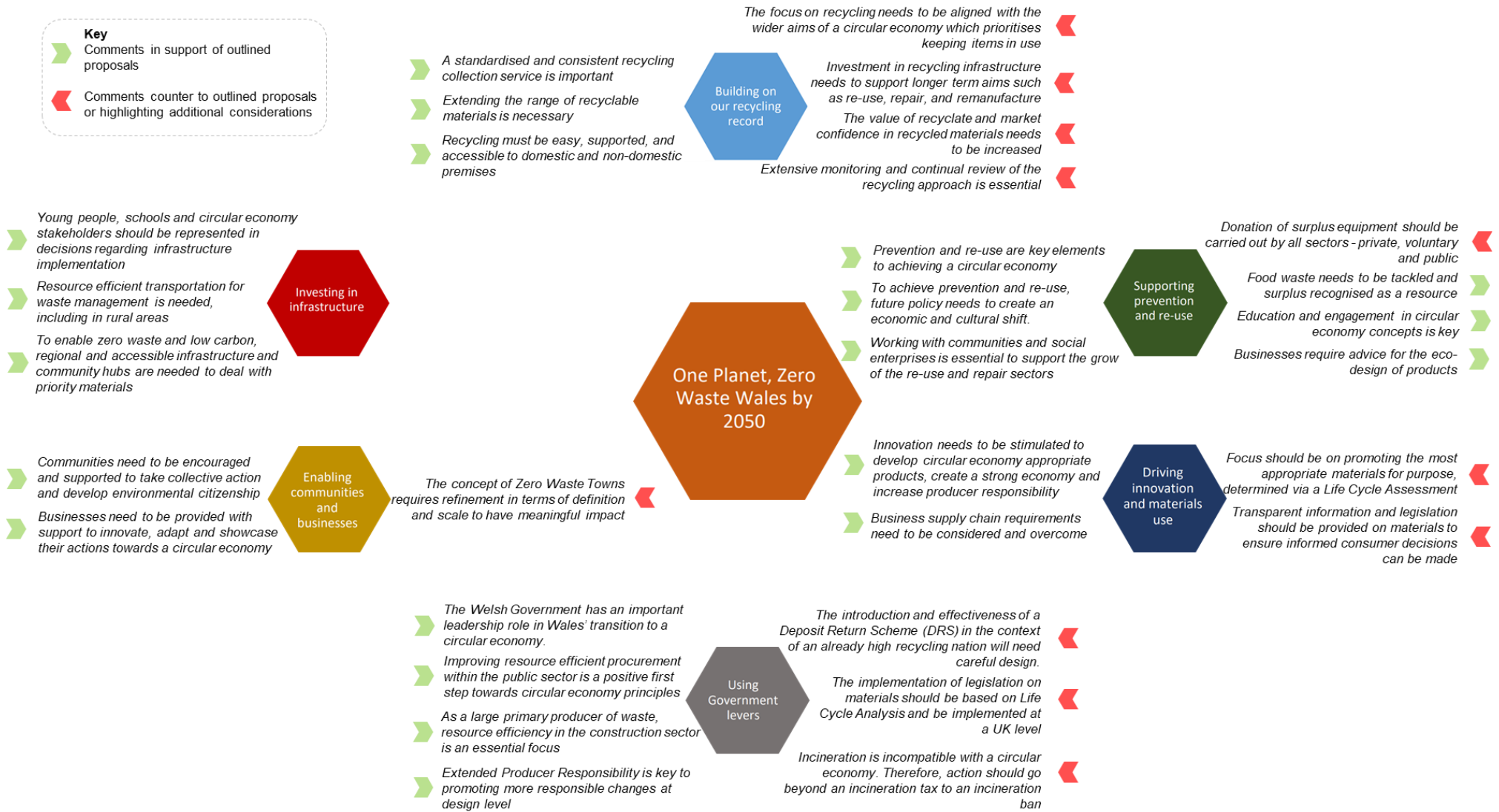
Figure 0.1: Beyond Recycling consultation headlines by theme