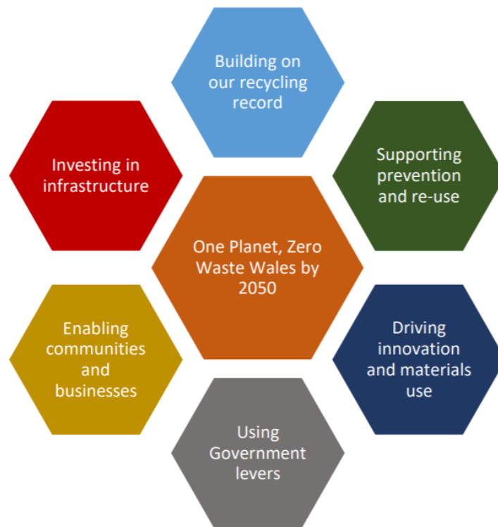
Figure 1.1: the six core themes of focus in Beyond Recycling