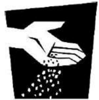
Mustard Seed Faith

This puzzle is based on Luke 17:5-6 (NIV)